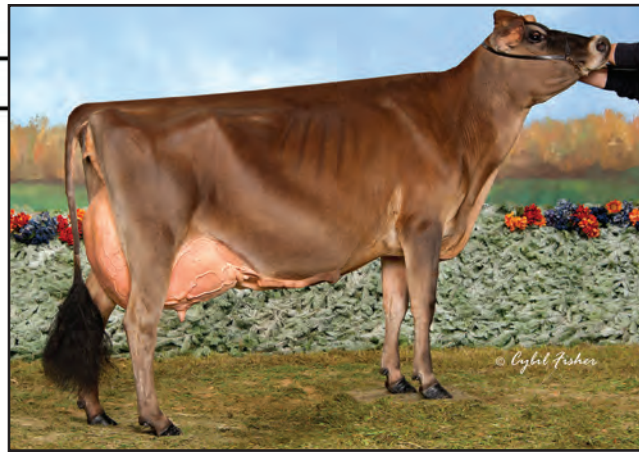
SUESS LEXICON RHONDA, E-93% Dam of Lot 116