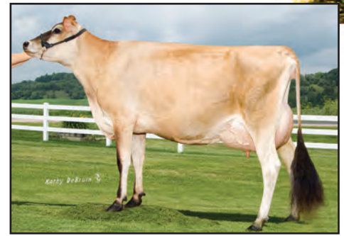
Sold in the 2009 Pot O'Gold Sale Jars of Clay latola 16710 2751, VG-87% 2-3 305 3x 20,230 4.6% 924 3.6% 727