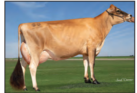
JER-Z-BOYZ PHAROAH ALYSSA 69243-P-ET Sister to the Great-Grandam of Lot 117