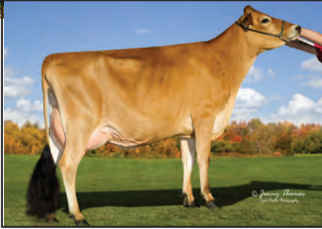
Sold in the 2017 Pot O'Gold Sale Sun Valley Jive Tart, E-90% 1-9 305 3x 19,890 5.5% 1,100 3.7% 726