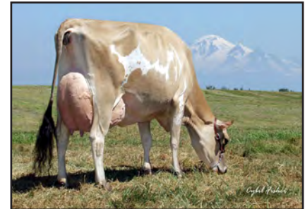
PLEASANT NOOK F PRIZE CIRCUS Seventh Dam of Lot 101

RIVER VALLEY LEMONHEAD CARNIVAL-ET USA 067393764 GT13K BBR 100 JH1F JNSF CDCB GPTA S 10/04/2022 ORECS 90%R 97%ILE 463M 0.03% 29F 0.00% 18P 460CM$ 454NM$ 429FM$ 5.3PL 2.3LIV 2.2DPR 3.3CCR 2.4HCR 2.82SCS 429GM$ 0.0MFV 0.2DAB -0.6KET 1.1MAS 0.7MET -0.2RPL 2.19HTI AJCA 10/04/2022 GPTAT 88%R 1.2 GJUI 11.9 GJPI 85%R 111