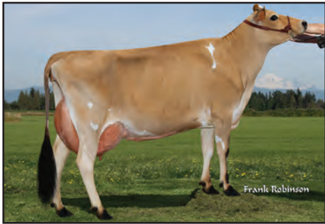
Sold in the 2009 Pot O'Gold Sale Kilgus Finalist Gem, VG-87% 1-11 365 36,400 5.0% 1,816 3.4% 1,226 Winner, 2011 Pot O'Gold Production Contest