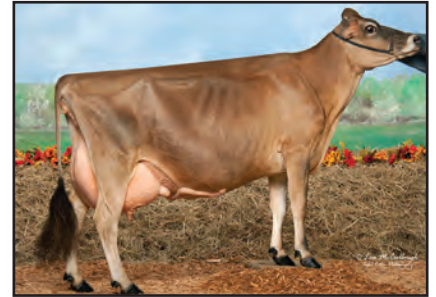
GABYS ARTIST AMBROSIA Fifth Dam of Lot 117