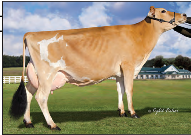
BW RENEGADE SALLY U572 {4}, VG-85% Fifth Dam of Lot 122