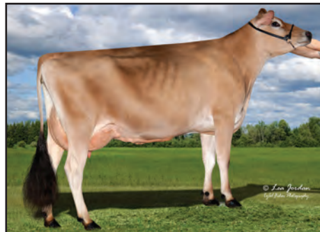
Sold in the 2016 Pot O'Gold Sale JX Clemson Lemonhead 330 604 {6}, E-91% 4-00 305 29,180 5.5% 1616 4.1% 1182 Winner, 2019 Pot O'Gold Production Contest