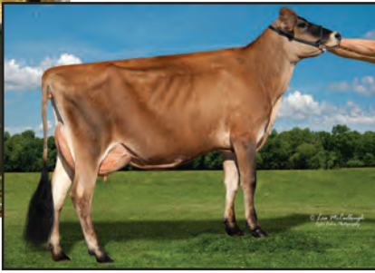
KEVETTA CELEBRITY VIVICA Sister to the Grandam of Lot 124