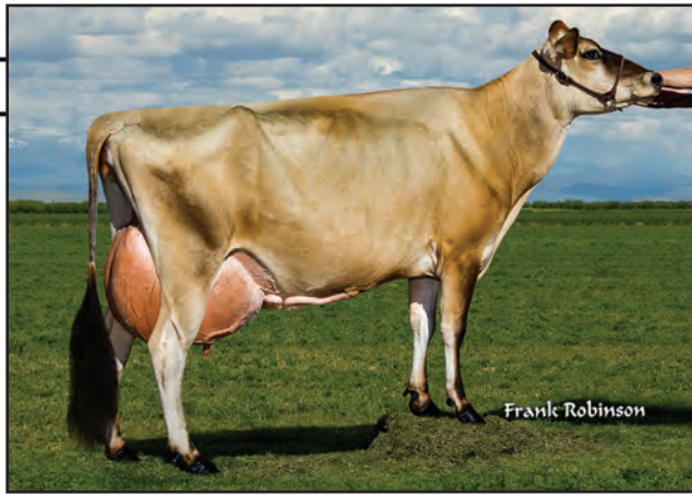
AHLEM ACTION BUTTONS 31973, E-93% Fourth Dam of Lot 104