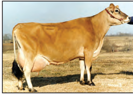
Sold in the 1994 Pot O'Gold Sale LJF2 SB Berretta Haley, E-90% 4-2 365 32,420 5.2% 1,678 4.3% 1,386 Former #1 PTI Cow Winner, 1997 Pot O'Gold Production Contest