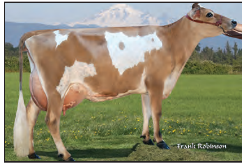
Sold in the 2007 Pot O'Gold Sale Havs latola Topaz, E-91% 3-1 365 43,110 5.0% 2,144 3.5% 1,522 Winner, 2010 Pot O'Gold Production Contest