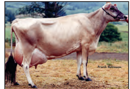
TURBO K-LEE OF SUN VALLEY Sixth Dam of Lot 115

ALL LYNNS VALENTINO IRWIN-ET USA 117423084 GT50K BBR 100 JH1C JNSF A2A2 7JE1163 CDCB GPTA S 08/01/2022 4451DAUS 891HRDS 3%RIP 99%R -21M -0.01% -4F 17%ILE 99%R -0.01% -3P 111CM$ 110NM$ 118FM$ -2GM$ 2.8PL 1.3LIV -2.6DPR -2.4CCR 1.5HCR 2.90SCS 0.2MFV 0.0DAB -0.1KET 1.5MAS 0.1MET 0.5RPL 4.84HTI AJCA 08/01/2022 2608DAUS GPTAT 99%R 0.9 GJUI 12.6 GJPI 99%R 13