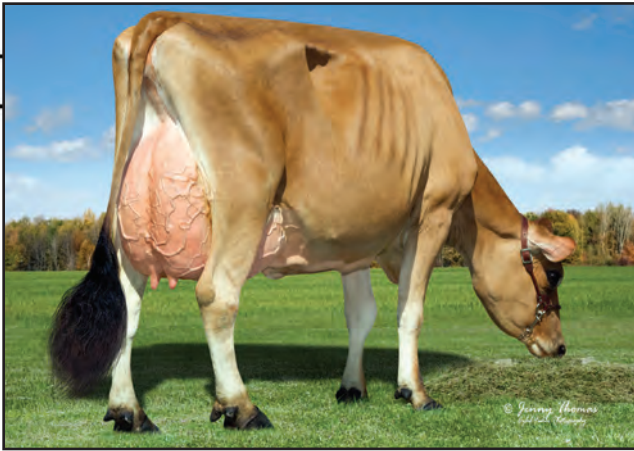
DUTCH HOLLOW IMPISH CHINCHILLA-P-ET, E-91% Grandam of Lot 109