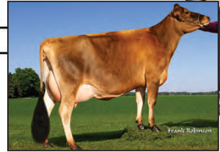
PRIMUS VICEROY CAMILLE 23108-ET Dam of Lot 101

ISDK VJ GROENBJERG HALEY HEAVY JEDNK00000304496 GT50K BBR 100 JH1F JNSF A2A2 236JE4496 CDCB GPTA S 08/01/2022 583DAUS 238HRDS 88%RIP 89%R -140M 0.28% 53F 92%ILE 89%R 0.15% 27P 561CM$ 538NM$ 384FM$ 571GM$ 2.8PL -0.8LIV 1.6DPR 1.9CCR 1.1HCR 2.73SCS 0.1MFV -0.4DAB -0.2KET -0.2MAS 0.5MET 0.1RPL -1.18HTI AJCA 08/01/2022 309DAUS GPTAT 81%R -0.3 GJUI 4.4 GJPI 83%R 132