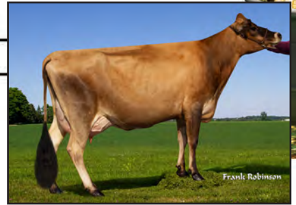
JX PRIMUS ENZO CHARLIZE 668 {4}-ET Grandam of Lot 103

4TH DAM: GOFF PHAROAH CIRCUS ACT-ET 90% 7-04 305 2 27290 4.5 1216 3.2 862 101DCR 2975C RANKS ON THE TOP 1-1/2% LIST FOR JPI