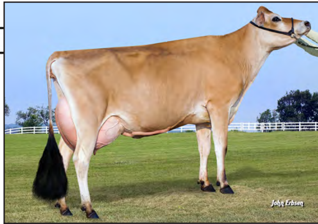
JO-KIRCH CHROME CHIRP CHIRP, VG-85% Dam of Lot 114