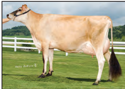
JARS OF CLAY IATOLA 16710 2751 Fourth Dam of Lot 114