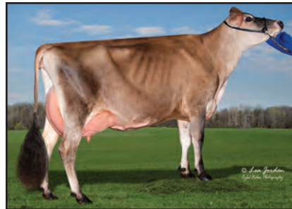
KEVETTA CITATION A VERNA-ET Sister to the Grandam of Lot 124