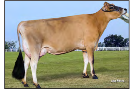
JX PRIMUS ENZO CHANEL 24267 {4}-ET, VG-85% Sister to the Dam of Lot 101

TOG TEAL 36676-ET 86% JE840003149715765 GT BBR 100 JH1F JNSF DHIA HERD # 21-55-0913 CONTROL # 36676 2-00 289 3 14000 5.5 769 3.7 523 93DCR 1809C 3-00 296 3 22000 5.1 1118 3.8 827 94DCR 2861C 305 2X ME AVG 2L 20384M 1088F 770P 2662C PPA 709M 99F 68P / YD 839M 74F 54P CDCB GPTA S 10/04/2022 2RECS 83%R 97%ILE 509M 0.05% 35F 0.04% 28P 454CM$ 448NM$ 390FM$ 3.7PL 1.7LIV 0.8DPR 2.1CCR 3.8HCR 3.06SCS 422GM$ 0.1MFV 0.2DAB -0.1KET -1.2MAS 0.5MET -0.2RPL -0.26HTI AJCA 10/04/2022 GPTAT 83%R 0.9 GJUI 9.7 GJPI 79%R 103