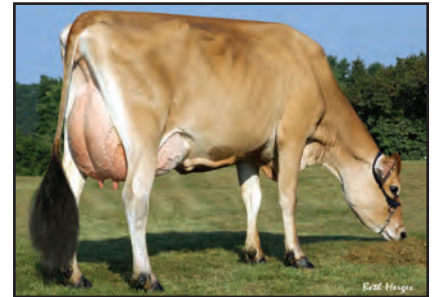
DUTCH HOLLOW VALENTINO CHERYL-ET Fourth Dam of Lot 109

4TH DAM: DUTCH HOLLOW VALENTINO CHERYL-ET 90% 2-08 305 3 24660 4.3 1066 3.3 803 102DCR 2772C