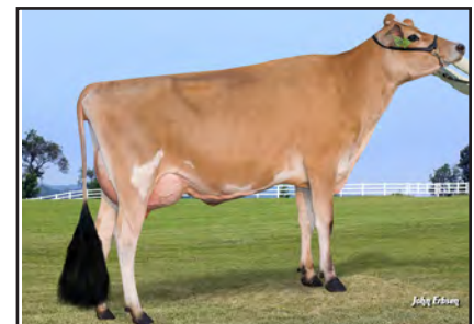
RIVER VALLEY CRAZE JOY 7224, VG-87% Sister to the Grandam of Lot 101

7TH DAM: PLEASANT NOOK F PRIZE CIRCUS 97% 6-04 305 2 22920 4.5 1038 3.5 813 90DCR 2786C