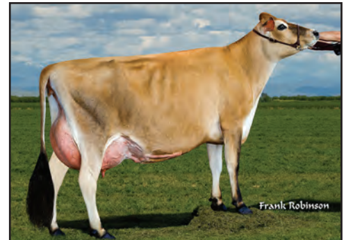
Sold in the 2012 Pot O'Gold sale Peelers Louie Presca, VG-87% 2-11 305 27,900 4.6% 1,274 3.4% 961 Winner, 2015 Pot O'Gold Production Contest