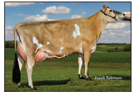
Sold in the 2013 Pot O'Gold Sale Hilmar Vermeer 39176 {6}, E-92% 3-10 297 3x 27,050 4.3% 1,157 3.7% 1,010