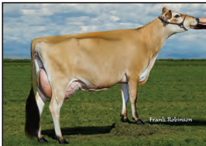
AHLEM RENEGADE BUTTONS 38500, E-90% Same Family as Lot 104