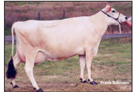
SUN VALLEY KHAN KAYLEE Fifth Dam of Lot 115

CDF VICEROY-ET JE840003002447507 GT50K BBR 100 JH1F JNSF A2A2 11JE1179 CDCB GPTA S 08/01/2022 10851DAUS 443HRDS 21%RIP 99%R 788M -0.01% 35F 65%ILE 99%R 0.02% 34P 330CM$ 328NM$ 284FM$ 300GM$ 2.3PL 1.1LIV 0.3DPR 2.0CCR 4.1HCR 3.15SCS 0.1MFV 0.2DAB 0.2KET -2.9MAS 0.7MET -0.3RPL -2.84HTI AJCA 08/01/2022 4928DAUS GPTAT 99%R 0.5 GJUI 1.0 GJPI 99%R 78