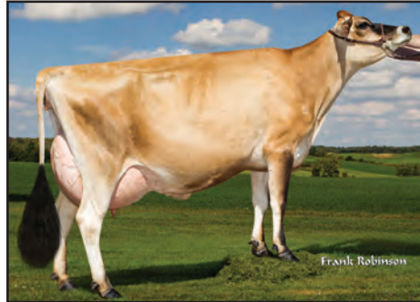
Sold in the 2014 Pot O'Gold Sale JX Buttercrest Clark Goblet {4}, E-91% 5-04 305 3x 26,110 4.5% 1184 3.9% 1026