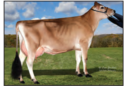
DUTCH HOLLOW SANTANA CHIQUITA-P-ET Great-Grandam of Lot 109

HILMAR VICEROY MIAMI USA 17252682 GT99K BBR 100 JH1F JNSF A2A2 7JE1657 CDCB GPTA S 08/01/2022 672DAUS 73HRDS 78%RIP 98%R 872M -0.16% 7F 56%ILE 98%R 0.02% 37P 299CM$ 292NM$ 240FM$ 218GM$ 2.9PL 1.8LIV -1.0DPR -0.1CCR 1.0HCR 2.96SCS 0.1MFV 0.0DAB 0.3KET -1.3MAS -0.1MET 0.0RPL -0.93HTI AJCA 08/01/2022 206DAUS GPTAT 95%R 1.2 GJUI 5.5 GJPI 93%R 66