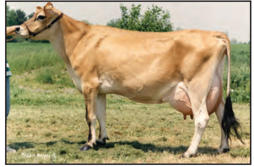
Sold in the 1991 Pot O'Gold Sale Mar Kut Sooner 920, E-91% 3-0 305 24,190 4.7% 1,131 3.2% 774 Winner, 1996 Milking Competition Brazil National Winner, 1994 Pot O'Gold Production Contest