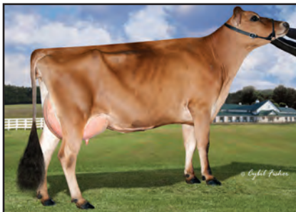
AHLEM VOLCANO BUTTONS 42731, E-91% Same Family as Lot 104