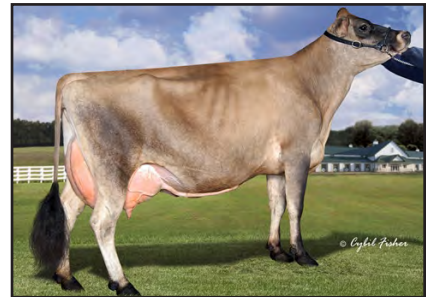
GOFF PHAROAH CIRCUS ACT-ET Fourth Dam of Lot 103