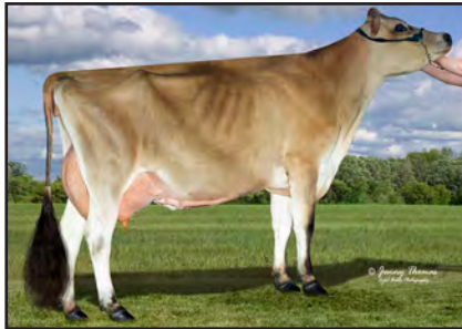
JX RIVER VALLEY WLD CUP SARINE 5710 {5}-ET Grandam of Lot 122