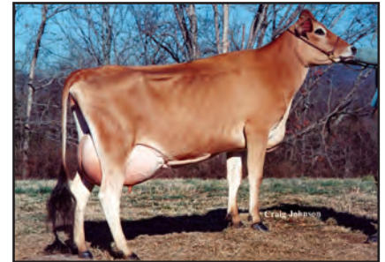
GABYS IATOLA AMETHUST-ET Sixth Dam of Lot 117