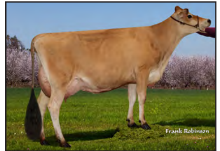
JX PRIMUS ENZO CALISTA 20062 {4}-ET Sister to the Grandam of Lot 103