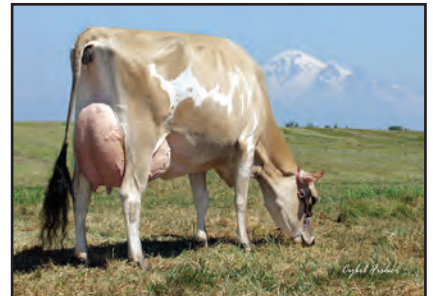
PLEASENT NOOK F PRIZE CIRCUS, E-97% Eighth Dam of Lot 103