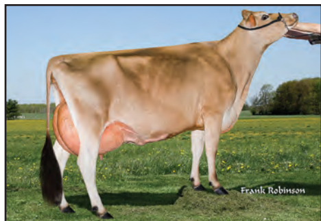
Sold in the 2011 Pot O'Gold Sale Heinz Lotto Linette 7132 {4}, VG-88% 4-10 305 3x 21,770 4.8% 1,039 3.7% 797