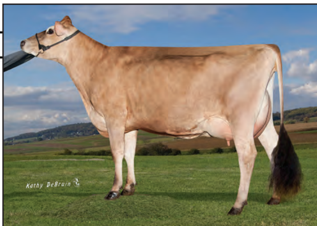
CAL-MART CRITIC PERIE 5958-P, VG-85% Fourth Dam of Lot 118