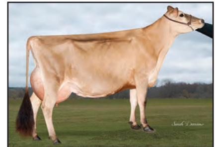
JX AVI-LANCHE MILTON DEDE 8232 {5}, VG-86% Same Family as Lot 105

JX FARIA BROTHERS MALDINI {4}-ET JE840003135124483 GT99K BBR 100 JH1F JNSF A2A2 7JE1604 CDCB GPTA S 08/01/2022 2013DAUS 79HRDS 9%RIP 99%R 247M 0.21% 57F 62%ILE 99%R 0.05% 19P 316CM$ 309NM$ 252FM$ 222GM$ 0.7PL 0.6LIV -3.3DPR -2.5CCR 2.3HCR 2.94SCS 0.3MFV -0.2DAB -0.2KET -3.2MAS -1.8MET -0.5RPL -4.67HTI AJCA 08/01/2022 497DAUS GPTAT 98%R 0.8 GJUI 4.0 GJPI 97%R 58