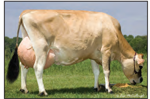
Sold in the 2005 Pot O'Gold Sale Ahlem Jace Charm 15069-ET, VG-88% 2-1 305 3x 33,550 4.6% 1,546 3.1% 1,048 Winner, 2008 Pot O'Gold Production Contest