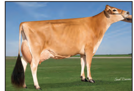
SCENIC VIEW SAXON ALYMPIAN-P-ET Sister to the Dam of Lot 117