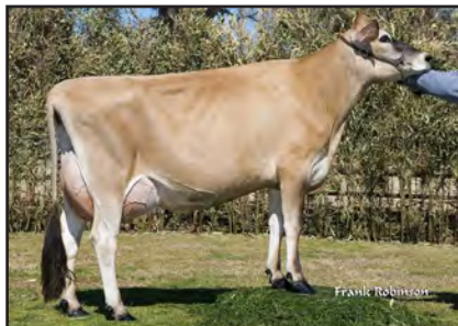
AHLEM COUNTRY ELLA 16710 Fifth Dam of Lot 114