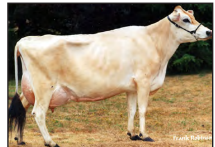
AHLARLAY LESTERS K-TEL Seventh Dam of Lot 115

KILGUS DAVID KIMBER 88% USA 118591579 GT80K BBR 100 JH1F JNSF TATTOO /K642 DHIA HERD # 33-51-0672 CONTROL # 1642 1-11 305 2 12860 3.8 486 3.5 453 95DCR 1406C 3-05 292 2 18050 4.1 747 3.6 648 96DCR 2094C 4-06 305 2 19530 4.2 820 3.6 698 98DCR 2280C 5-08 305 2 21610 4.0 856 3.6 776 98DCR 2447C 6-08 305 2 21210 4.1 863 3.5 733 97DCR 2396C 7-11 305 2 21830 4.4 950 3.5 760 97DCR 2572C 305 2X ME AVG 6L 19673M 798F 694P 2240C PPA -580M -110F -20P / YD -426M -68F -7P CDCB GPTA S 10/04/2022 5RECS 83%R 21%ILE -130M -0.17% -42F 0.01% -3P -81CM$ -84NM$ -91FM$ 2.1PL 0.8LIV 1.2DPR 1.1CCR 0.9HCR 2.91SCS -99GM$ -0.2MFV 0.2DAB 0.4KET 2.5MAS 0.5MET 0.3RPL 4.13HTI AJCA 10/04/2022 GPTAT 81%R 0.2 GJUI 4.4 GJPI 80%R -10 SIRE: SUNSET CANYON DAVID-ET GJPI 29 24%ILE