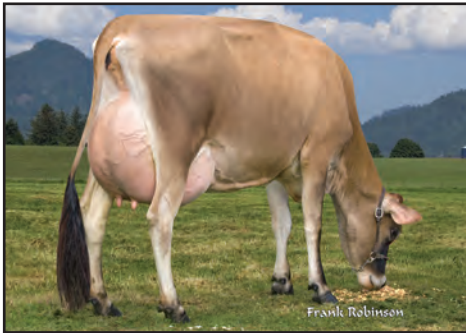
Sold in the 2008 Pot O'Gold Sale Boyd-Lee Matinee Holly-ET, VG-86% 1-11 305 19,120 4.7% 904 3.4% 655