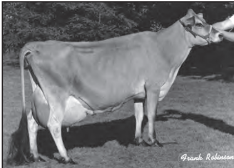
Sold in the 1987 Pot O'Gold Sale Duncan Brave PR Dee, VG-84% 7-3 305 24,920 4.7% 1,165 3.7% 911 Winner, 1990 Pot O'Gold Production Contest