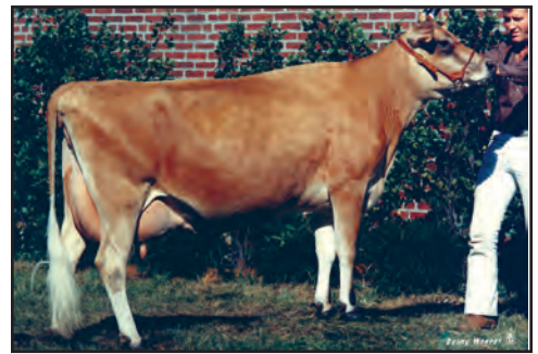
Sold in the 1967 Pot O'Gold Sale Ettas Master Babe, E-94% 11-4 365 17,550 5.3% 922 Winner, 1970 Pot O'Gold Production Contest 1970 National Jersey Jug Futurity Winner