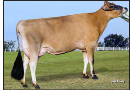
JX PRIMUS ENZO CHANEL 24267 {4}-ET Sister to the Grandam of Lot 103