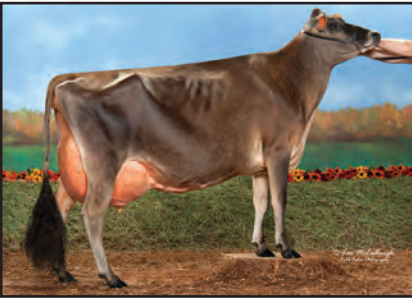
RATLIFF ACTION ANGEL Sister to the Grandam of Lot 120