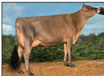
RATLIFF VELOCITY ALPHA-ET Sister to the Grandam of Lot 120

BORN 09/22/2021 TATTOO A767/A767 P6 BBR 100 FEMALE EFI 8.8% JH1F JNSF A2A2