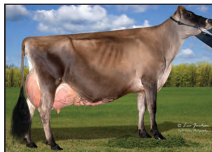
OAKFIELD TBONE VIVIANNE-ET Great-Grandam of Lot 124