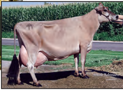
AHLEM AVERY BUTTONS 8100 Sixth Dam of Lot 104