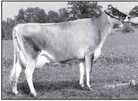
Sold in the 1986 Pot O'Gold Sale Greenwood Chief Glad Tidings, VG-85% 4-6 305 22,590 4.9% 1,097 3.6% 806 Winner, 1989 Pot O'Gold Production Contest