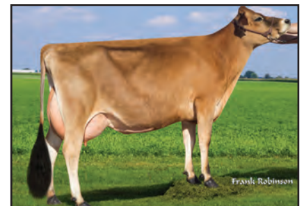
JX AVI-LANCHE VOLCANO DEDE 15794 {5} Great-Grandam of Lot 105

JX KASH-IN GOT JIGGY {6}-ET JE840003138463636 GT99K BBR 100 JH1F JNSF A2A2 551JE1717 CDCB GPTA S 08/01/2022 1435DAUS 80HRDS 76%RIP 99%R 1370M 0.08% 85F 97%ILE 99%R 0.03% 58P 729CM$ 717NM$ 632FM$ 596GM$ 4.2PL -0.6LIV -2.7DPR -1.6CCR 0.0HCR 2.84SCS 0.0MFV 0.1DAB 0.1KET -0.6MAS 0.7MET -0.1RPL -0.29HTI AJCA 08/01/2022 776DAUS GPTAT 99%R 1.2 GJUI -0.9 GJPI 94%R 146