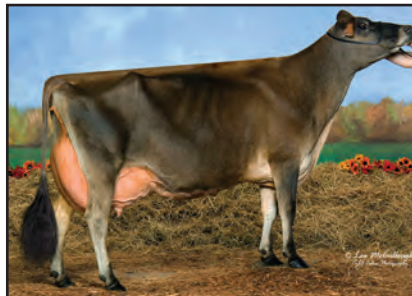
RATLIFF PRICE ALICIA Great-Grandam of Lot 120