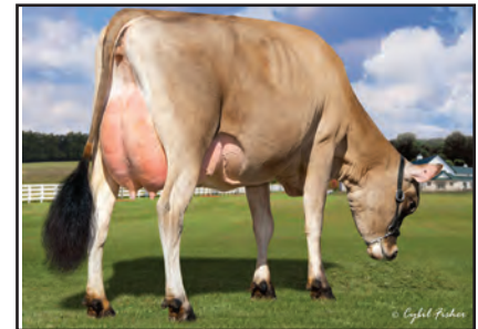
GOFF PHAROAH CIRCUS ACT-ET Great-Grandam of Lot 101

CDF VICEROY-ET JE840003002447507 GT50K BBR 100 JH1F JNSF A2A2 11JE1179 CDCB GPTA S 08/01/2022 10851DAUS 443HRDS 21%RIP 99%R 788M -0.01% 35F 65%ILE 99%R 0.02% 34P 330CM$ 328NM$ 284FM$ 300GM$ 2.3PL 1.1LIV 0.3DPR 2.0CCR 4.1HCR 3.15SCS 0.1MFV 0.2DAB 0.2KET -2.9MAS 0.7MET -0.3RPL -2.84HTI AJCA 08/01/2022 4928DAUS GPTAT 99%R 0.5 GJUI 1.0 GJPI 99%R 78