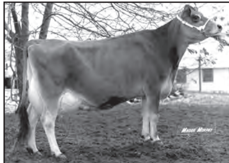
Sold in the 1971 Pot O'Gold Sale Generators Faustine of Ogston, E-93% 4-3 365 24,440 4.3% 1,059 Dam of A-Nine Top Brass Winner, 1974 Pot O'Gold Production Contest