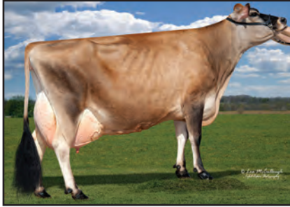
AHLEM CELEBRITY BUTTONS 34191, E-91% Same Family as Lot 104