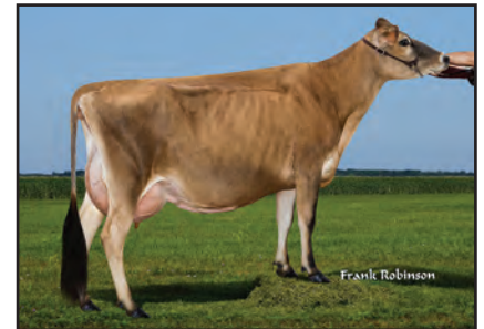
JX AVI-LANCHE PELE DEDE 18512 {4}-ET, VG-81% Same Family as Lot 105

JX JER BEL BANCROFT ADELINE {6} 92% USA 119963766 GT9K BBR 100 JH1F JNSF TATTOO /K399 DHIA HERD # 31-72-9017 CONTROL # 399 1-11 305 3 16190 4.6 751 3.6 582 104DCR 2008C 2-11 305 3 21940 4.5 980 4.2 922 104DCR 2855C 3-11 305 3 20700 4.9 1012 3.7 776 104DCR 2685C 305 2X ME AVG 3L 18854M 902F 748P 2479C PPA 1560M 41F 67P / YD 1931M 39F 64P CDCB GPTA S 10/04/2022 4RECS 85%R 96%ILE 1141M -0.14% 25F -0.03% 35P 425CM$ 422NM$ 413FM$ 3.0PL 1.8LIV 0.4DPR 0.8CCR 2.6HCR 2.84SCS 391GM$ 0.2MFV 0.4DAB 0.3KET -0.7MAS 0.6MET -0.2RPL 3.06HTI AJCA 10/04/2022 GPTAT 83%R 1.3 GJUI 9.5 GJPI 80%R 105