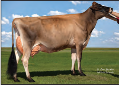
KEVETTA APPLEJACK VEGAS Sister to the Grandam of Lot 124