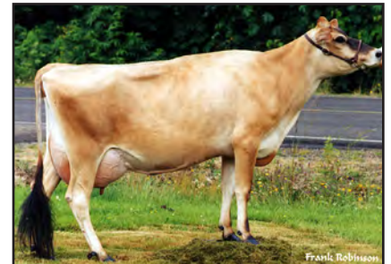
WOODSTOCK BERRETTA LESLIE Fourth Dam of lot 127

HILMAR VICEROY MIAMI USA 172552682 GT99K BBR 100 JH1F JNSF A2A2 7JE1657 CDCB GPTA S 08/01/2022 672DAUS 73HRDS 78%RIP 98%R 872M -0.16% 7F 56%ILE 98%R 0.02% 37P 299CM$ 292NM$ 240FM$ 218GM$ 2.9PL 1.8LIV -1.0DPR -0.1CCR 1.0HCR 2.96SCS 0.1MFV 0.0DAB 0.3KET -1.3MAS -0.1MET 0.0RPL -0.93HTI AJCA 08/01/2022 206DAUS GPTAT 95%R 1.2 GJUI 5.5 GJPI 93%R 66