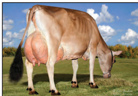
Sold in the 2012 Pot O'Gold Sale Waukeek Plus Jolt 3277 {6}-ET, E-92% 4-5 305 31,380 4.3% 1,362 3.8% 1,200