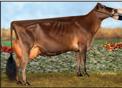
RATLIFF TEQUILA AVELANCHE-ET Sister to the Grandam of Lot 120