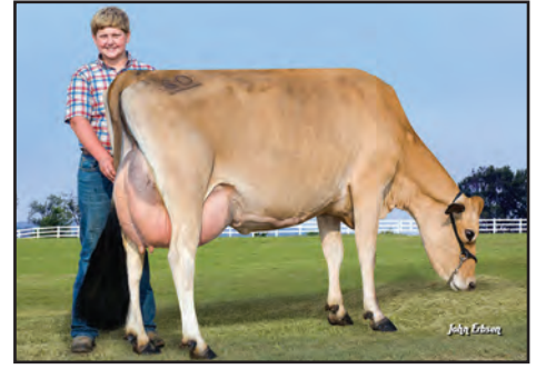
Sold in the 2018 Pot O'Gold Sale JX Jer-Z-Boyz Got Maid 61357 {6}, VG-86% 3-1 305 19,310 5.3% 1,024 4.0% 782 Dam of POTO GOLD and JUMPSTART