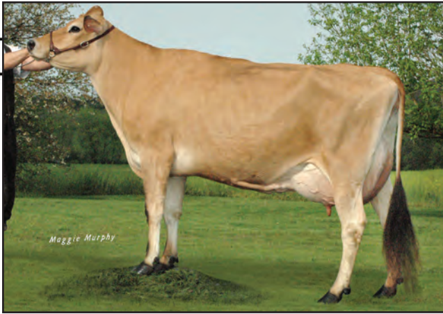
GABYS JACINTO ALYSSA, E-93% Fourth Dam of Lot 117