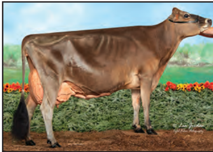
AHLEM MAUI BUTTONS 44738, E-95% Same Family as Lot 104