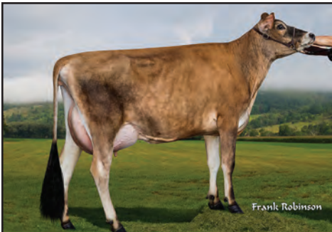
Sold in the 2013 Pot O'Gold Sale Lost Hill Dimension Holly, VG-84% 1-10 291 19,680 6.7% 1,325 3.7% 737 Winner, 2016 Pot O'Gold Production Contest