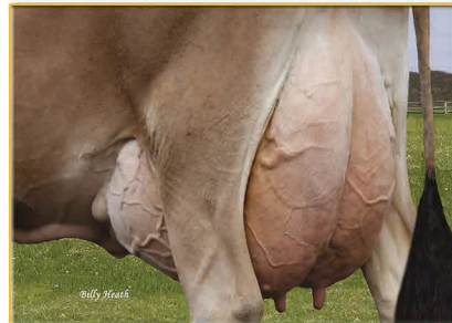
LUCKY HILL JOKER WABORITA, VG-87%