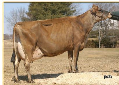
KEMP KO LEMVIG DEBORHA, E-90%

Her April 2017 great-granddaughters sells. The dam is a VG-81% PREMIER followed by a VERBATIM. The next dam is a "Lyndsay." Menda Jerseys, Vt.