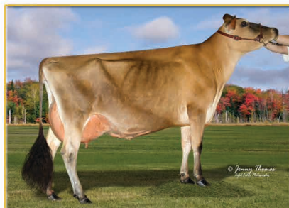
MENDA EXCITATION LYND SAY-ET, E-94%

Selling her July 2016 VARIETY daughter due in September to GENTRY. The next dam is an E-95% BARBER followed by an E-91% JUNO. Billings Farm & Museum, Vt.