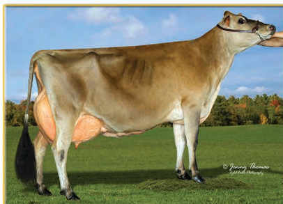
BILLINGS ACTION SASSY, E-93%

Her fresh LEMONHEAD granddaughter sells and is +25.4 GJUI and +154 GJPI. The dam is a VG-85% BALLISTIC. A maternal sister to the consignment sold for $24,700 at last year's All American Sale. Lucky Hill Farm, Vt. They also send a +176 GJPI daughter of JX BALTAZAR {5}.