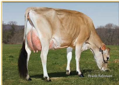
HIGH LAWN HEADLINE