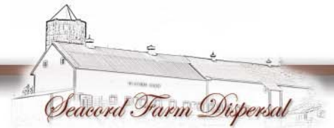
SEACORD FARM COMERICA CLASSY, E-94% Grandam of Lot 661A