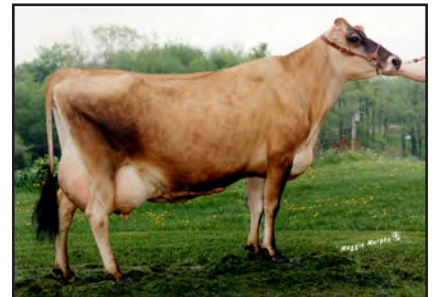
DUTCH HOLLOW BARBER DANA Fourth Dam of Lot 2A