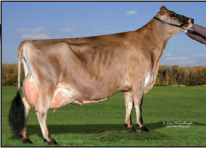
GABYS TBONE BUTTERCUP-ET Grandam of Lot 9