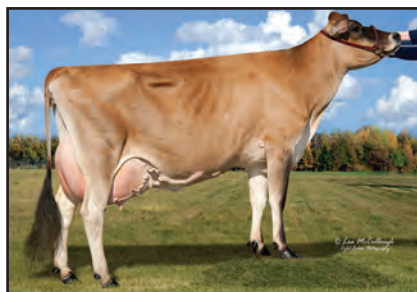
Summetz Mecca Savannah Shanttell-ET, VG-88% 3-9 305 27,150 4.8% 1,297 3.6% 965 Sold in the 2009 Sale