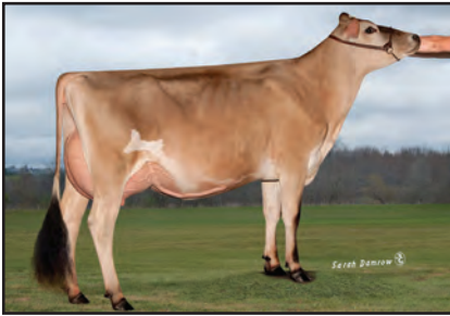
All Lynns Irwin Trista-ET, E-91% 4-9 305 19,400 4.4% 857 3.5% 687 Sold in the 2013 Sale

The production is bred into every heifer selected for the National Heifer Sale. Buyers of previous consignments have realized the benefits of this potential.