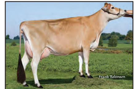
Jars of Clay Plus Vanessa {6}, E-90% 1-10 305 14,960 4.8% 725 3.7% 549 Sold in the 2012 Sale