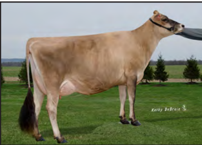
JX PINE TREE AVON DELLA {3}-ET Sister to the Dam of Lot 5