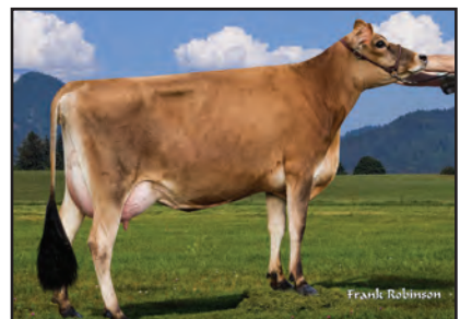
Pine Hill Zipper Luminata, VG-82% 2-10 297 15,550 4.8% 746 3.8% 587 Sold in the 2015 Sale