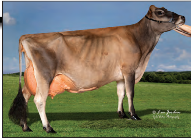
SEACORD FARM LENNOX LUCINDA-P, E-93% Dam of Lot 19