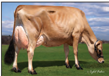
Hillview Louie Katiki-P, E-90% 3-2 305 3x 26,950 4.5% 1,024 3.0% 817 Sold in the 2013 Sale