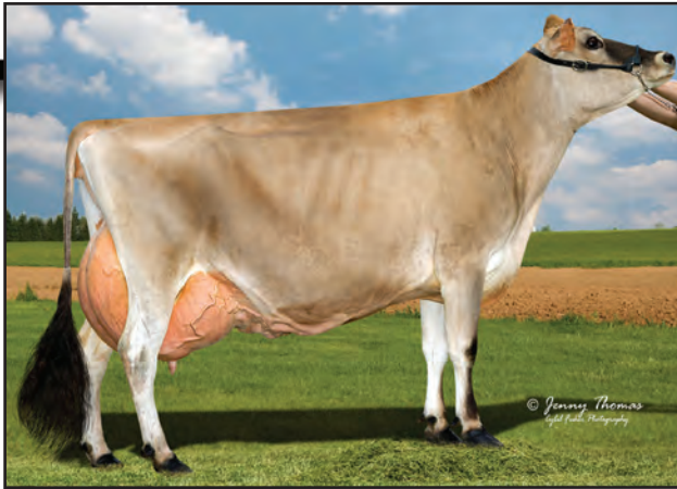
SUNSET CANYON GG FP ANTHEM, E-91% Grandam of Lot 14