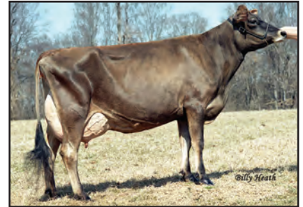
HILLACRES STAR BRIGHT-ET Fourth Dam of Lot 32

JARS OF CLAY VALENTINO BRIDGET-P 91% USA 067243298 GT50K BBR 100 JH1F DHIA HERD # 93-54-0855 CONTROL # 3298 1-09 305 3 20640 4.3 893 3.3 684 95DCR 2362C 2-11 305 3 26210 4.6 1194 3.4 903 83DCR 3120C 305 2X ME AVG 2L 24711M 1102F 849P 2923C PPA 4736M 134F 123P / YD 3561M 94F 88P CDCB GPTA S 06/04/2019 2RECS 91%R 91%ILE 1197M -0.11% 33F -0.04% 34P 346CM$ 347NM$ 350FM$ 4.0PL -0.1LIV -2.9DPR -2.1CCR 1.5HCR 2.88SCS 230GM$ AJCA 06/04/2019 GPTAT 89%R 2.2 GJUI 21.7 GJPI 86%R 98