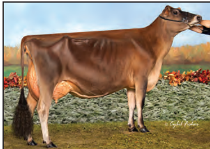
BILLINGS TEQUILA MAYA-ET Sister to the Dam of Lot 25