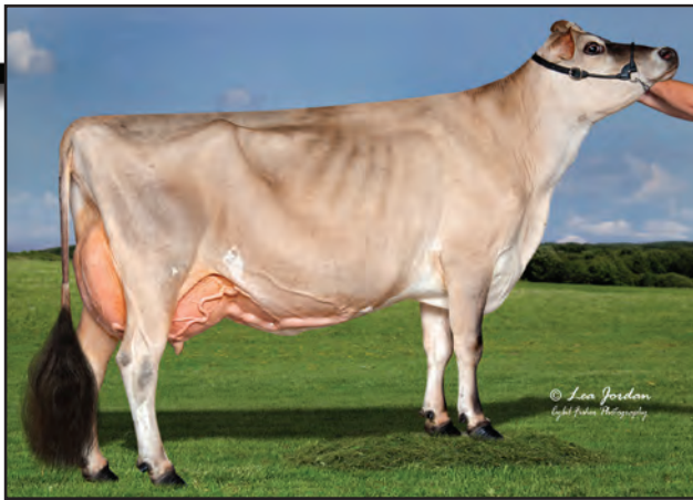
SSF BELLEVUE BLOSSOM, E-94% Dam of Lot 28