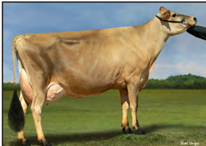
OAKLANE CHISEL DELLA 2130-ET Grandam of Lot 5