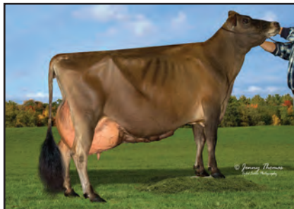
BILLINGS LEGION MINI ME Grandam of Lot 25