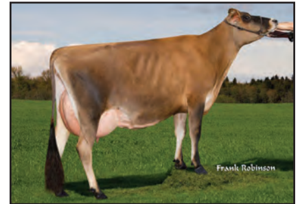
DP LOUIE MYALEAN 853 Great-Grandam of Lot 4

4TH DAM: DP MECCA MYRTLEAN 9249 90% 2-11 295 2 20290 4.0 802 3.5 706 103DCR 2262C