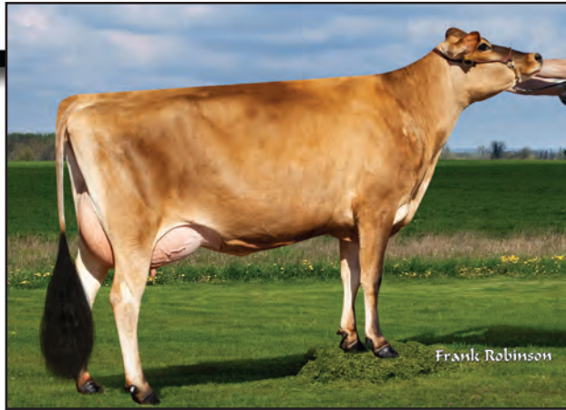
JX DUPAT LEONEL 15627 {4}, VG-81% Dam of Lot 1C