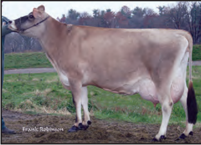
DUTCH HOLLOW KLASSIC DEVA-P-ET Grandam of Lot 2B