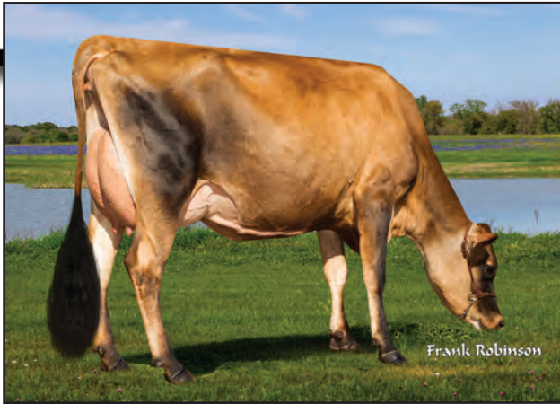
JX DUPAT LEONEL 15192 {4}, VG-85% Dam of Lot 1B