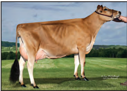
Marv Du Blackstone Easter {6}-ET, VG-87% 2-2 305 16,360 5.5% 906 4.0% 662 Sold in the 2010 Sale