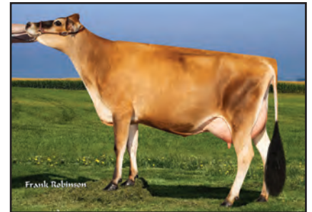
PROGENESIS MATRIMONY-ET Sister to the Dam of Lot 4