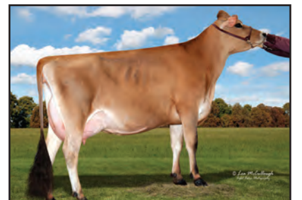
Heartland Topeka Madalyn-ET, VG-87% 3-4 290 3x 19,770 4.6% 902 4.0% 783 Sold in the 2014 Sale