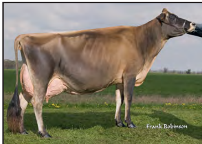
HURONIA CONNECTN CRYSTALYN 23L, SUP-EX 95-3E (CAN) Same Family as Lot 33