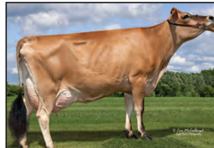
TJF/Lee Action Mamme 847-ET, E-92% 3-1 305 3x 19,550 5.4% 1,053 3.7% 721 Sold in the 2009 Sale