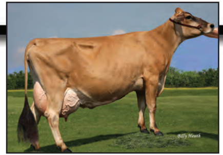
DUTCH HOLLOW REBEL DIVA-P Dam of Lot 2A

NEXT FOUR DAMS ARE VERY GOOD OR EXCELLENT