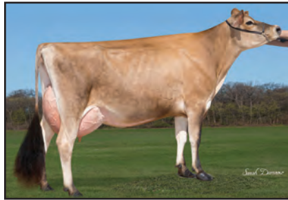
Forest Glen Clearvision Jadey, VG-83% 1-9 305 17,400 4.9% 853 4.0% 691 Sold in the 2016 Sale