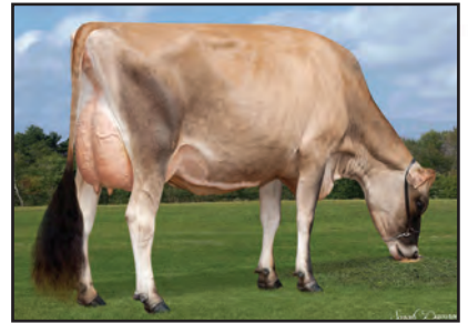
Clareshoe Allstar Zoom Zoom, E-91% 2-10 305 18,750 5.9% 1,111 3.9% 739 Sold in the 2014 Sale