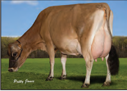
GABYS ACTION BABY-ET Great-Grandam of Lot 9