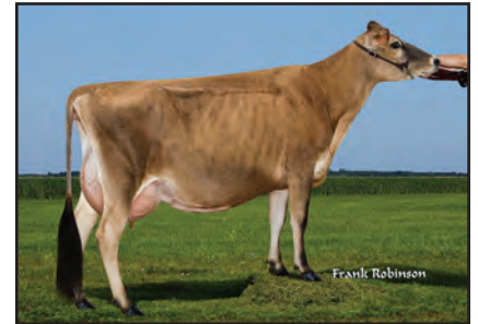
JX AVI-LANCHE MILTON DEDE 8232 {5} Sister to the Dam of Lot 20

SUNSET CANYON DOMINICAN-ET USA 117013483 GT50K BBR 100 JH1F 11JE770 CDCB GPTA S 04/01/2019 5646DAUS 525HRDS 3%RIP 99%R 559M 0.05% 37F 34%ILE 99%R 0.01% 22P 300CM$ 289NM$ 266FM$ 266GM$ 3.4PL -0.3LIV 1.0DPR 0.1CCR 3.7HCR 2.86SCS AJCA 04/01/2019 1564DAUS GPTAT 99%R -0.4 GJUI -2.3 GJPI 99%R 88