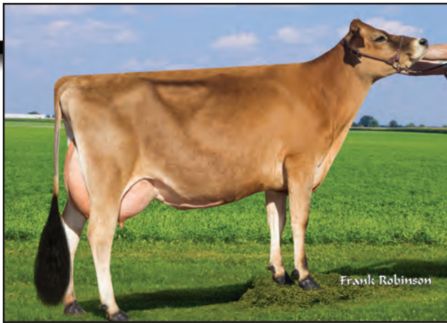
JX AVI-LANCHE VOLCANO DEDE 15794 {5}, VG-86% Dam of Lot 20