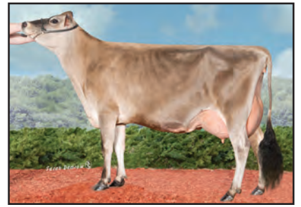
Family Hill Moment Fawn, E-90% 2-11 305 17,430 6.1% 1,055 3.9% 673 Sold in the 2010 Sale