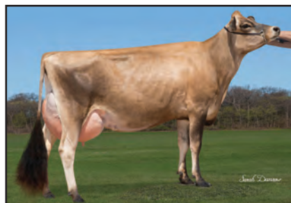
JX Crescent Premium Gudlady{5}-ET, VG-82% 1-8 305 17,740 5.6% 985 3.8% 669 Sold in the 2016 Sale