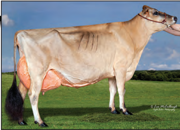
DREAMROAD SULTAN KEEPTRYING, E-94% Same Family as Lot 12