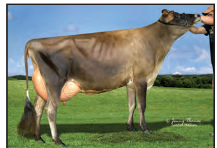
OAKFIELD MINISTER VENICE-ET Sister to the Dam of Lot 6