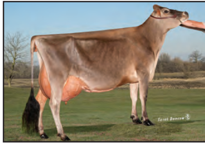
Hilmar Celebrity 26191, E-93% 3-11 305 25,770 5.3% 1,374 3.8% 972 Sold in the 2011 Sale