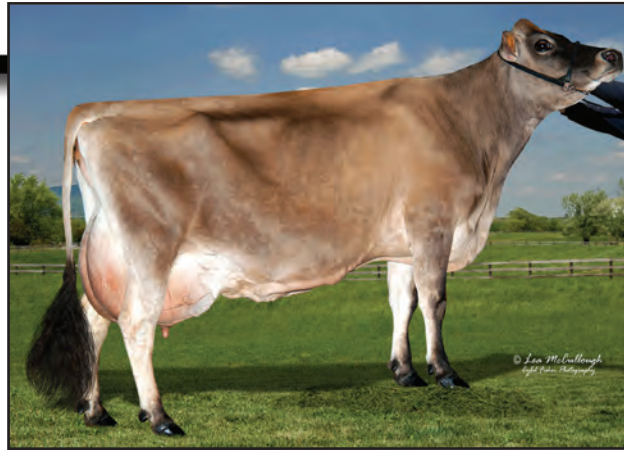
POOLE PARAMOUNT REANNE, E-94% Fourth Dam of Lot 37