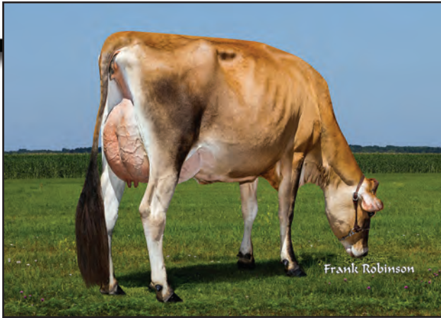
AHLEM TITAN VANITY 1245, E-93% Sister to the Grandam of Lot A