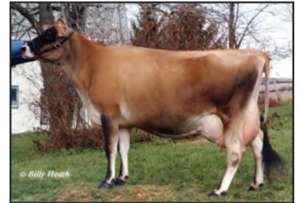
NOBLEDALE JUNO VERMONT, E-94% Fifth Dam of Lot 18

SHAN-MAR HILARIO CHISEL-ET USA 067108037 GT80K BBR 100 JH1F 7JE1375 CDCB GPTA S 04/01/2019 54DAUS 13HRDS 28%RIP 91%R 315M 0.23% 62F 76%ILE 92%R 0.10% 31P 513CM$ 476NM$ 397FM$ 425GM$ 3.8PL 0.3LIV 0.3DPR 0.6CCR 1.2HCR 2.89SCS AJCA 04/01/2019 43DAUS GPTAT 89%R 1.1 GJUI 10.4 GJPI 85%R 143