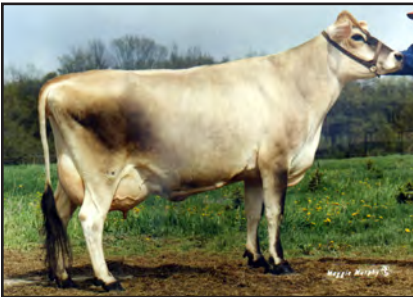
DUTCH HOLLOW LESTER MISCHIEF-P-ET, E-91% Fifth Dam of Lot 13

CDCB GPTA S 06/04/2019 ORECS 76%R 98%ILE 776M 0.04% 46F 0.03% 34P 470CM$ 450NM$ 409FM$ 4.7PL 1.7LIV 0.1DPR 1.6CCR 2.7HCR 2.90SCS 393GM$ AJCA 06/04/2019 GPTAT 76%R 1.1 GJUI 14.7 GJPI 71%R 138 ST SR DF RA RW RL FA FU 1.1 0.6 1.0 L0.7 0.8 S0.4 S0.2 1.4 RH RW UC UD TP TL RTR RTS 1.1 0.7 0.6 S1.4 W0.3 L0.3