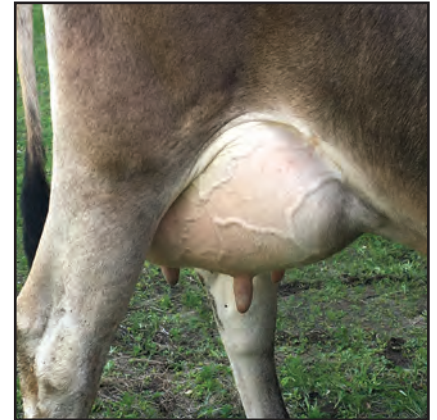
JX GRAFCO MARLO NIA {3} Udder of the Sister to Lot 26

GOFF PHAROAH CIRCUS ACT-ET 90% USA 067723964 GT45K BBR 100 JH1F DHIA HERD # 33-87-0722 CONTROL # 23964 1-09 305 3 19130 4.5 856 3.5 665 103DCR 2289C 2-11 305 3 21340 4.5 959 3.5 751 104DCR 2574C 305 2X ME AVG 2L 22200M 1000F 784P 2687C PPA 3387M 147F 115P / YD 3119M 126F 104P CDCB GPTA S 06/04/2019 2RECS 84%R 98%ILE 1037M -0.10% 28F -0.03% 31P 460CM$ 459NM$ 457FM$ 6.1PL 3.3LIV 1.9DPR 2.4CCR 2.5HCR 2.93SCS 434GM$ AJCA 06/04/2019 GPTAT 82%R 1.8 GJUI 24.5 GJPI 79%R 140