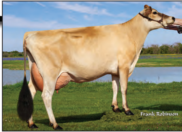
AHLEM MONUMENT PANSY 50457, VG-80% Dam of Lot 17