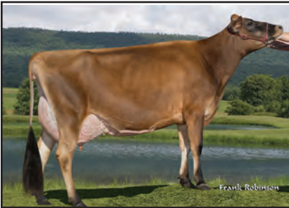
GABYS BLACKSTONE BRASSY-ET Sister to the Grandam of Lot 9