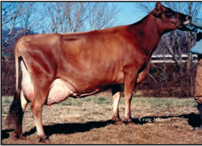
GABYS LEMVIG BARBIE Fourth Dam of Lot 9