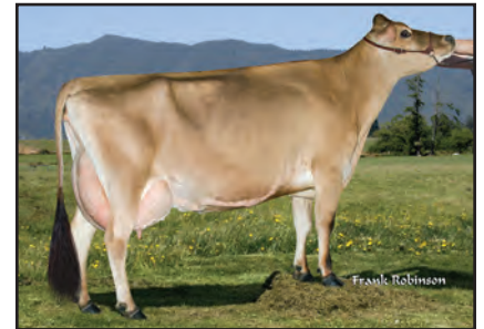
SUNSET CANYON F PRIZE T ANTHEM-ET Great-Grandam of Lot 14

NEXT FIVE DAMS ARE VERY GOOD OR EXCELLENT