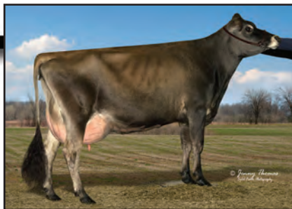
BILLINGS MINISTER MARNI-ET Dam of Lot 25