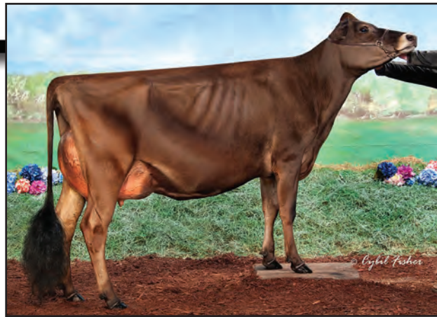
TOPLINE TEQUILA CHAMPAGNE, VG-87% Dam of Lot 33