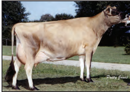
HURONIA GROVE CRYSTAL 37D Fourth Dam of Lot 33