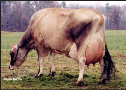
DUTCH HOLLOW B MASQUERADE-P Fourth Dam of Lot 13