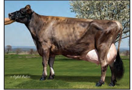
HILLACRES MIDNIGHT STAR-ET Great-Grandam of Lot 32

HEARTLAND MERCHANT TOPEKA-ET USA 067332021 GT50K BBR 100 JH1F 7JE1169 CDCB GPTA S 04/01/2019 11430DAUS 1235HRDS 11%RIP 99%R 400M 0.14% 47F 17%ILE 99%R 0.04% 22P 152CM$ 141NM$ 114FM$ 24GM$ -0.2PL -6.5LIV -4.9DPR -5.3CCR -0.9HCR 3.26SCS AJCA 04/01/2019 4320DAUS GPTAT 99%R 1.9 GJUI 22.3 GJPI 99%R 36