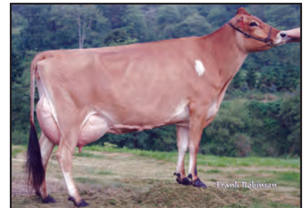
SUNSET CANYON THUNDER ANTHEM 3-ET Fourth Dam of Lot 14