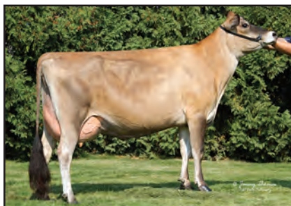
BILLINGS KAPTAIN MAKITA Sister to the Grandam of Lot 25