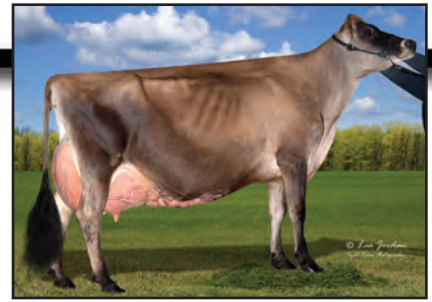
OAKFIELD TBONE VIVIANNE-ET Dam of Lot 6

ARETHUSA RESURRECTION VERSACE-ET 93% 7-09 305 2 22150 5.4 1190 4.0 877 96DCR 3036C ARETHUSA RESPONSE VANITY-ET 93% 5-10 305 2 22760 6.4 1465 3.3 751 98DCR 2593C ARETHUSA RESPONSE VIVID-ET 96% 6-00 305 2 22670 6.5 1482 3.5 790 97DCR 2730C RESERVE SUPREME CHAMPION, 2012 WORLD DAIRY EXPO GRAND CHAMPION, 2012 EASTERN STATES EXPOSITION SUPREME CHAMPION, 2012 EASTERN STATES EXPOSITION GRAND CHAMPION, 2012 INTERNATIONAL JERSEY SHOW GRAND CHAMPION, 2012 ROYAL WINTER FAIR