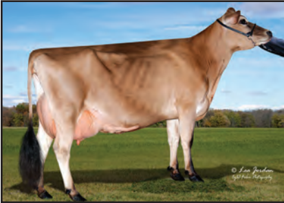
SCENIC VIEW MESCHACH BUTTERCUP-P-ET Sister to the Dam of Lot 9