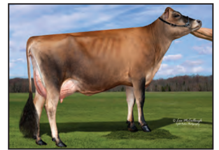
Heartland Pharoah Lindsey, VG-88% 3-4 305 21,700 5.0% 1,079 3.7% 806 Sold in the 2015 Sale