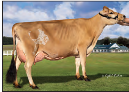
DP Prescott Gwen 1619, VG-88% 4-2 305 23,670 5.7% 1,342 3.6% 850 Sold in the 2013 Sale