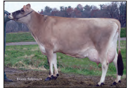
DUTCH HOLLOW KLASSIC DEVA-P-ET Grandam of Lot 2A