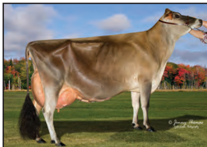
BILLINGS FUROR MEG Sister to the Dam of Lot 25