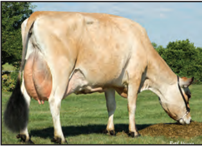
DUTCH HOLLOW ZIK MEDLY-P Grandam of Lot 13