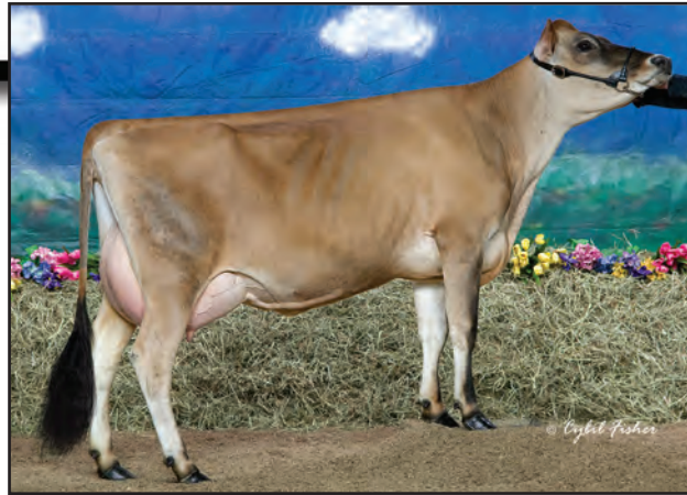
BILLINGS PERIMETER SYLVIA, E-93% Grandam of Lot 35