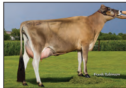
Hillview Machete Key-Charm-P-ET, VG-85% 1-11 305 3x 25,420 3.5% 882 3.0% 760 Sold in the 2015 Sale