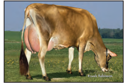
Pearlmount Jimmie Dawn-ET, E-90% 1-11 305 17,226 4.0% 686 3.7% 644 Sold in the 2010 Sale