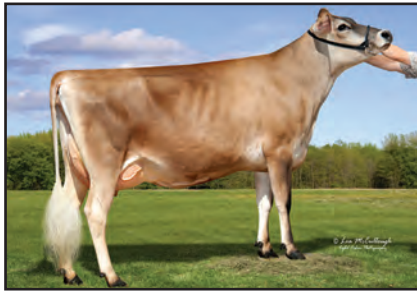
MS Irwin 7762 X899, VG-88% 3-10 305 23,710 4.5% 1,058 3.7% 883 Sold in the 2014 Sale

These well-known animals have contributed to the Jersey breed as we know it today. Many sons, grandsons, and female descendants have made their mark on the A.I. industry and as mothers of sons around the country.