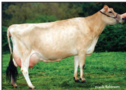
TENN HAUG E MAID, E-93% Seventh Dam of Lot 5