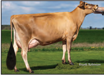
DUPAT ISAAC 15608 Dam of Lot 1A