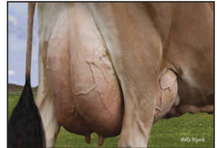
LUCKY HILL JOKER WABORITA Udder of the Great-Grandam of Lot 10