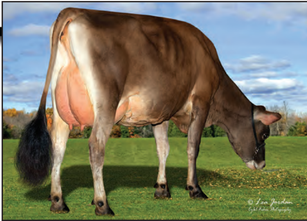
DP AXIS MCKENNA 1983-ET, VG-88% Grandam of Lot 4