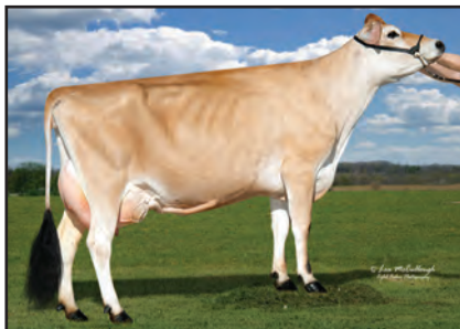
Hei-Bri Galvanize Calli, VG-87% 3-8 278 3x 24,120 4.7% 1,138 3.9% 929 Sold in the 2013 Sale