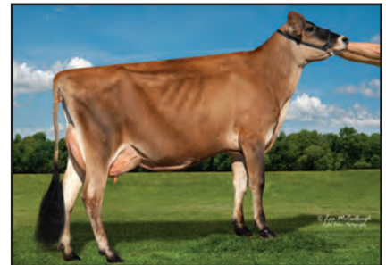
KEVETTA CELEBRITY VIVICA Sister to Lot 6