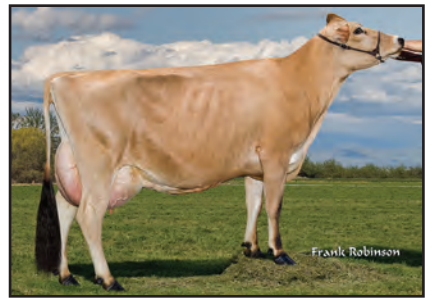
BW Renegade Charia X37, E-90% 4-2 278 17,980 5.0% 903 3.6% 656 Sold in the 2013 Sale