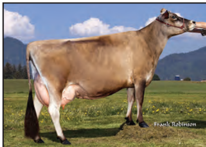
SUNSET CANYON IMPULS L MAID 4-ET, E-93% Sixth Dam of Lot 5