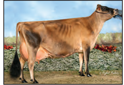
HURONIA CENTURION VERONICA 20J Great-Grandam of Lot 6