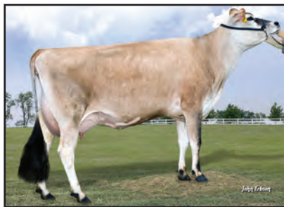
JX SR Goose Reaction {3}-P, E-94% 3-10 299 3x 23,450 4.9% 1,146 3.7% 866 Sold in the 2012 Sale