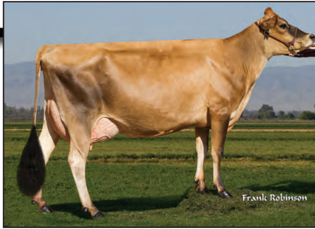
DUPAT SPARKY 3028, VG-85% Grandam of Lot 1A