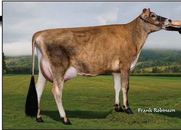
LOST HILL DIMENSION HOLLY, VG-84% Dam of Lot 15