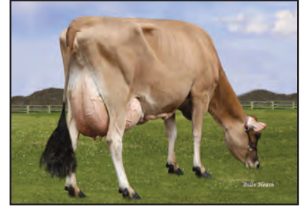
LUCKY HILL JOKER WABORITA Great-Grandam of Lot 10