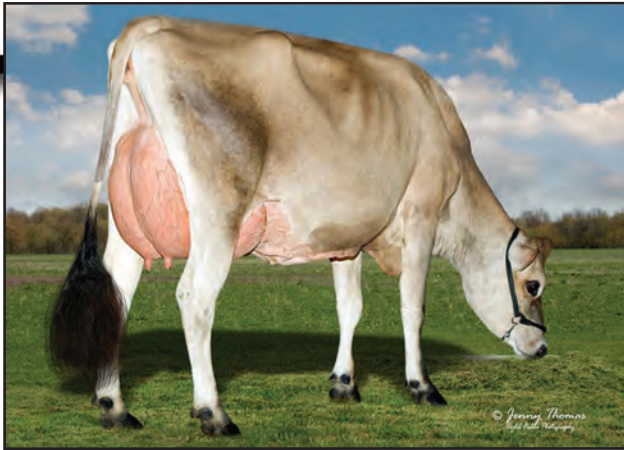
NOBLEDALE VICTORIOUS VIOLIN, VG-88% Dam of Lot 18