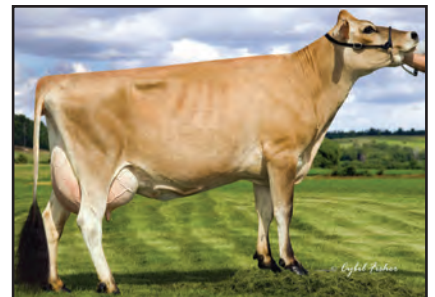
DUTCH HOLLOW NATHAN DEE-ET Sister to the Dam of Lot 2A