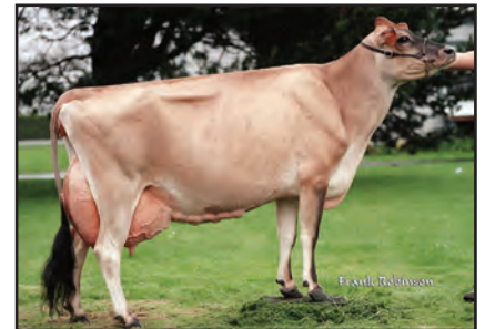
SUNSET CANYON MBSB ANTHEM-ET, E-95% Fifth Dam of Lot 14