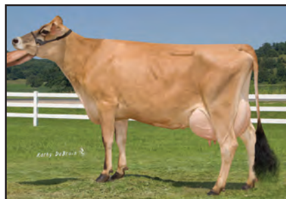
Boyd-Lee Matinee Habanero-ET, E-91% 5-10 305 3x 24,080 5.3% 1,272 3.5% 849 Sold in the 2008 Sale