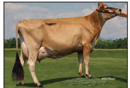
JX DUTCH HOLLOW GOLDA DEVON {4} Sister to the Dam of Lot 2A