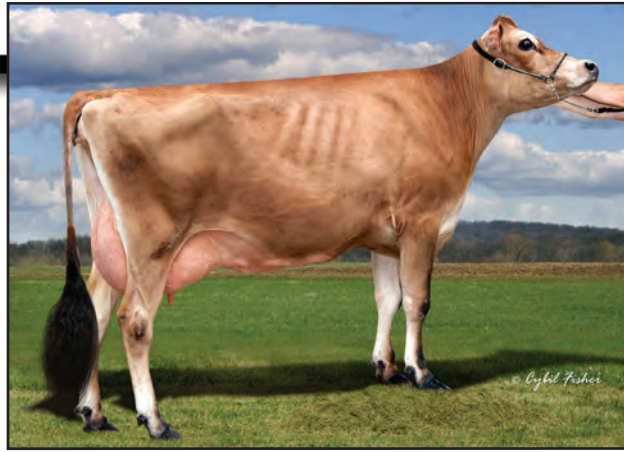
WETUMPKA MAGNUM JULIANNE-P, VG-86% Dam of Lot 21