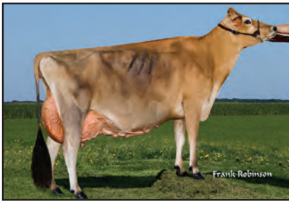
Free-Mar Blackstone Beeves, E-92% 4-2 305 3x 25,150 5.2% 1,307 3.5% 890 Sold in the 2009 Sale