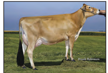
JX DP JAMMER MADISON 2006 {5}-ET Sister to the Grandam of Lot 4