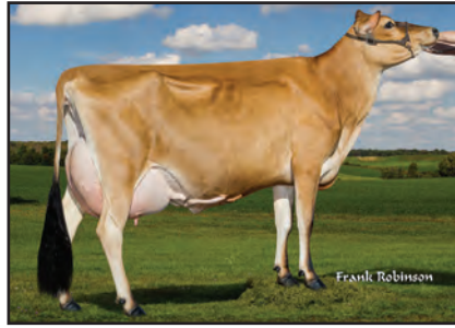
Hi-Land Daybreak Dotty, VG-86% 5-4 305 23,110 5.1% 1,175 3.8% 870 Sold in the 2014 Sale