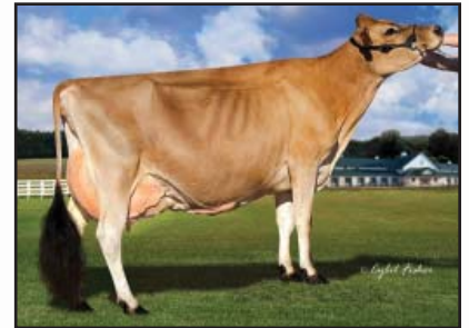
GABYS JACINTO ALYSSA Fourth Dam of Lot 8

4TH DAM: GABYS JACINTO ALYSSA 93% 3-03 305 2 22830 5.0 1140 3.6 825 102DCR 2853C