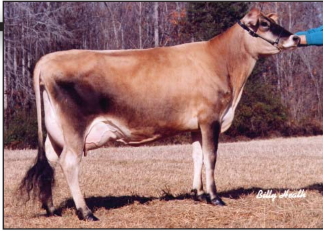
ALTHEA 3M 141-ET, VG-88% Fifth Dam of Lot 81