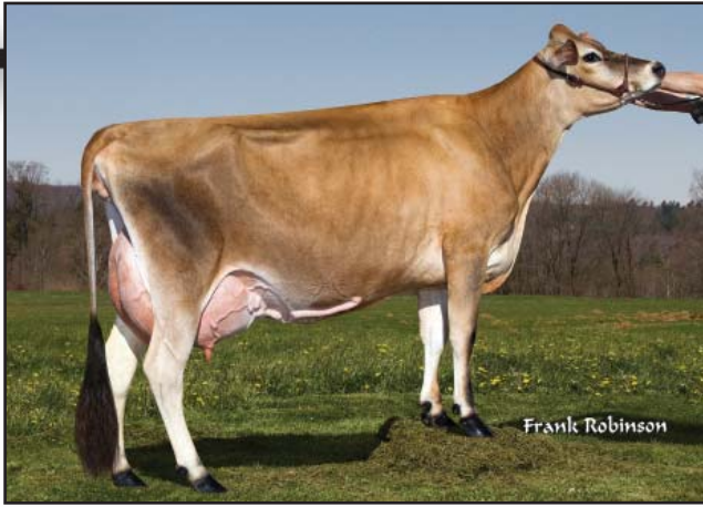
GABYS VALENTINO ANNALISA-ET, E-90% Great-Grandam of Lot 8