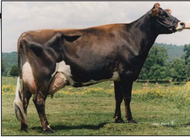
CHERUB COMMANDER FAWN, E-92% Fifth Dam of Lot 78