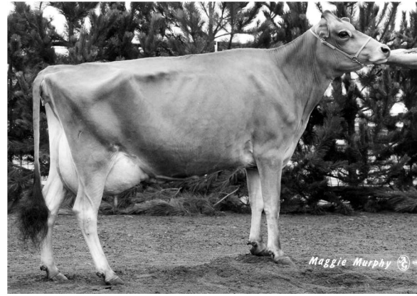
BUTTERFIELD SUNNY SENSCHAL, E-90% FOURTH DAM OF LOT 368