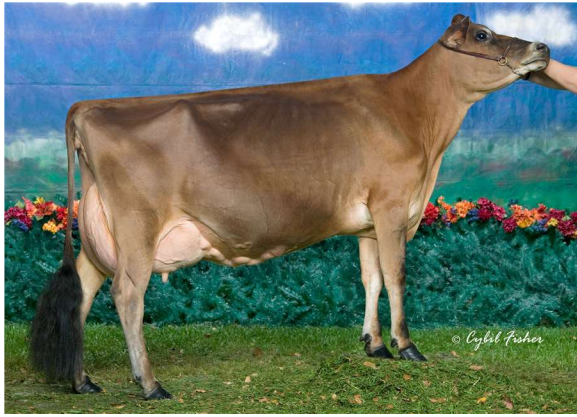
PLEASANT VALLEY MERCEDES SAGE, E-91% SISTER TO DAM OF LOT 368