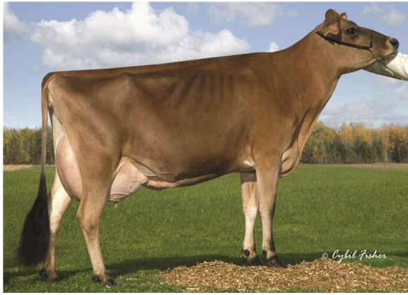
AVONLEA RER KANDACE, E-92% GREAT-GRANDAM OF LOT 364