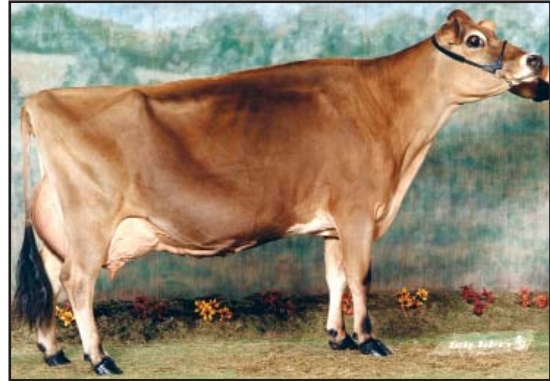
AVONLEA D JUDE KARMEL, E-94% GREAT-GRANDAM OF LOT 366