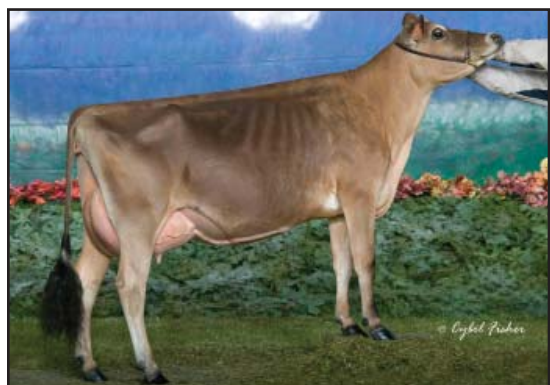
RATLIFF SAMBO KARLA-ET, E-93% SISTER TO THE GRANDAM OF LOT 366