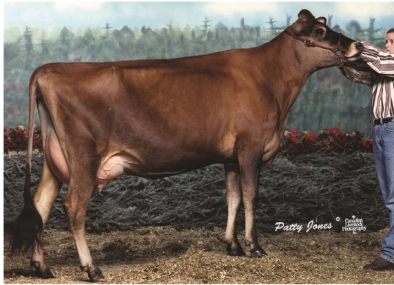
HOLLYLANE RENAISSANCE REBEL, E-90% GREAT-GRANDAM OF LOT 365