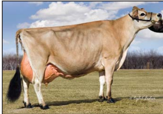
RATLIFF F PRIZE KANSAS-ET, E-95% SISTER TO THE GRANDAM OF LOT 366