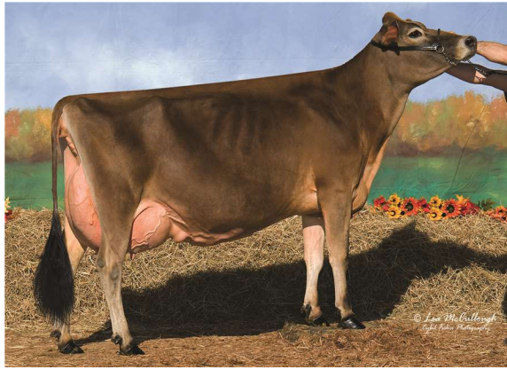
UVM IATOLA SERENITY-ET, E-91% GREAT-GRANDAM OF LOT 363