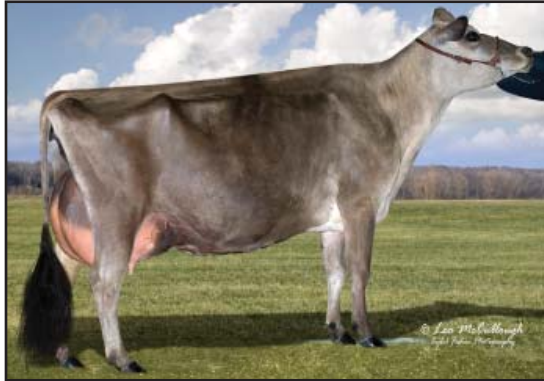
RENN KANDIE OF RATLIFF, E-95% GRANDAM OF LOT 366