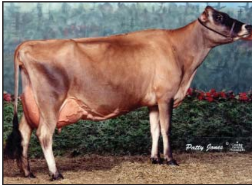
AVONLEA L MERIT KAPER, E-92% Great Grandam of Lot 367