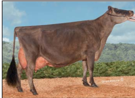
RATLIFF REN KENDRA-ET, E-95% SISTER TO THE GRANDAM OF LOT 366