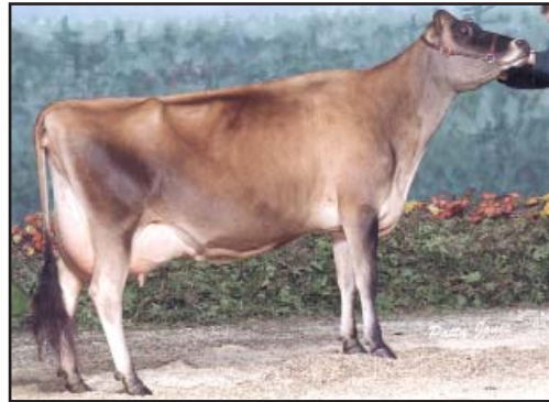
AVONLEA JUNO KRACKER-ET, EX 94-4E (CAN) Fourth Dam of Lot 367