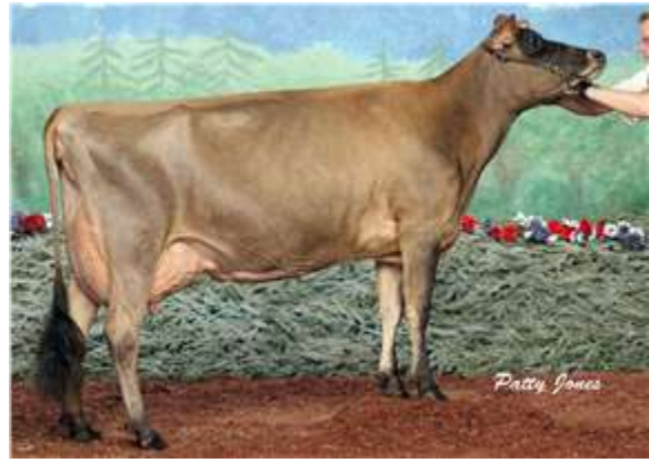
AVONLEA JADE KANDY, EX 90 (CAN) FOURTH DAM OF LOT 364