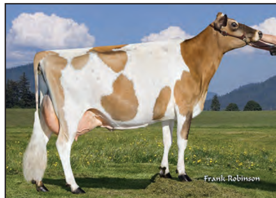
FAMILY HILL IATOLA CALICO, E-95% SISTER TO THE GRANDAM OF LOT 3