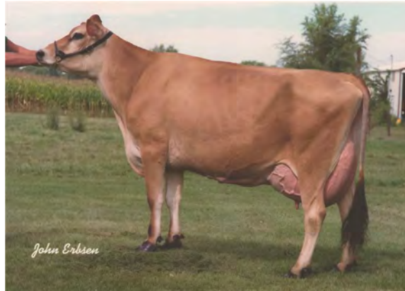
BOHNERTS BERRETTA JANA JOYCE, E-93% FIFTH DAM OF LOT 110L