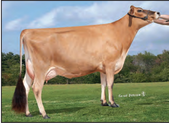
FAMILY HILL REN CARLY-ET, E-90% GRANDAM OF LOT 3