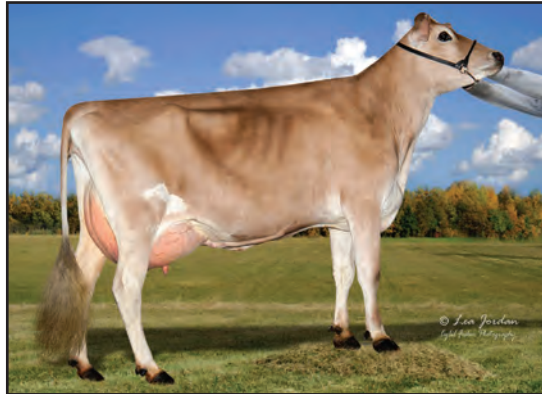
CINNAMON RIDGE NITRO PEPPERMINT-ET, VG-87% SISTER TO THE GRANDAM OF LOT 109C