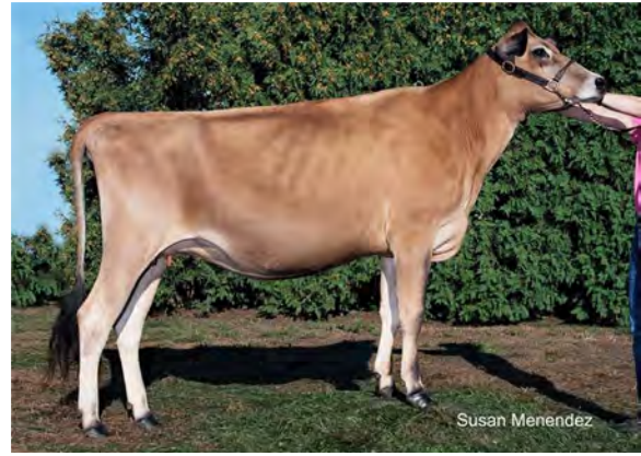
TIERNEYS PIEDMONT LUA {6}, E-94% FOURTH DAM OF LOT 36