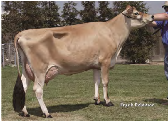
D&E PARAMOUNT VIOLET, E-90% FOURTH DAM OF LOT 7