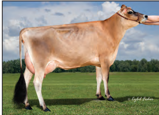
LYON ACTION CHALICE, E-92% DAM OF LOT 28