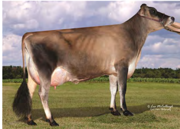
JX CINNAMON RIDGE TROY LOIS LANE {5}, E-91% SISTER TO THE DAM OF LOT 107B