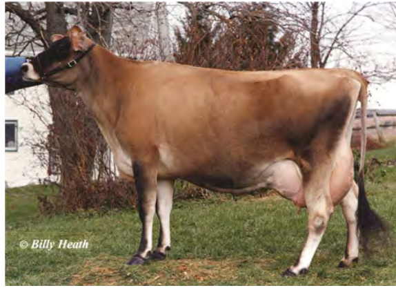
NOBLEDALE JUNO VERMONT, E-94% SIXTH DAM OF LOT 32