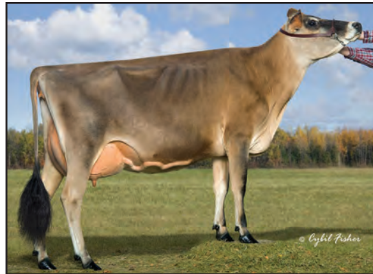
WOODMOHR JADE ROYALE, E-93% GREAT-GRANDAM OF LOT 35