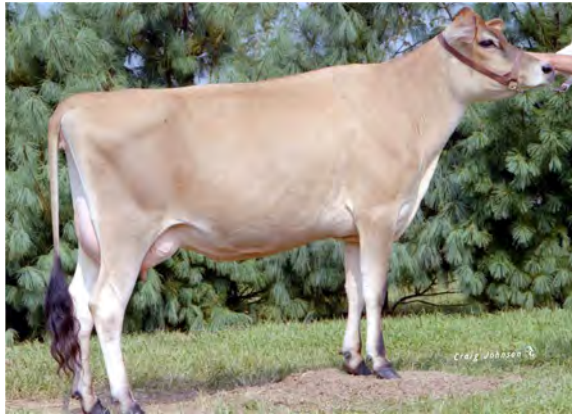
MILLERS PATRICK FARRAH, E-90% FOURTH DAM OF LOT 60