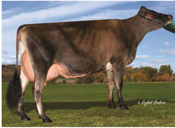
OKATO TORONTO BAILEY, VG-85% DAM OF LOT 79