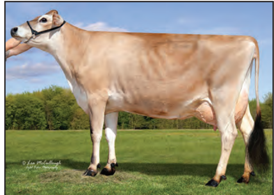
CINNAMON RIDGE DIMENSION AMEN-ET, VG-83% SISTER TO THE GRANDAM OF LOT 71