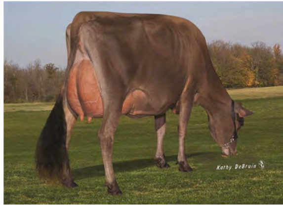
DEMENTS SUREFIRE ELVIRA, E-95% GRANDAM OF LOT 80