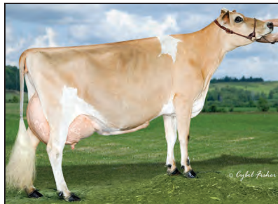
EMD LIEUTENANT RAMSEY, E-94% FOURTH DAM OF LOT 35