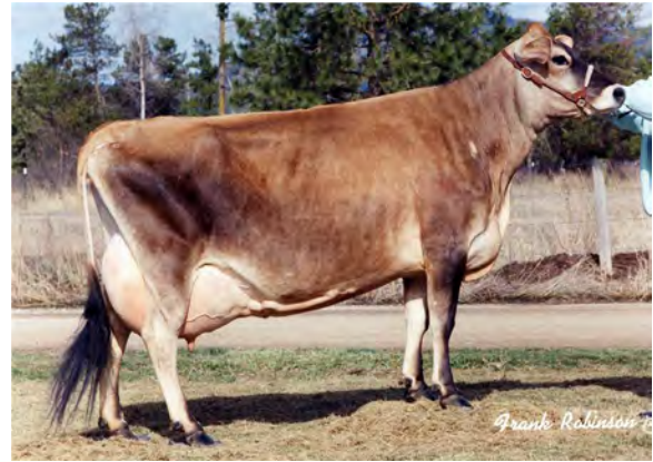
BETTYDON LESTER RITZY (6), E-90% EIGHTH DAM OF LOT 30