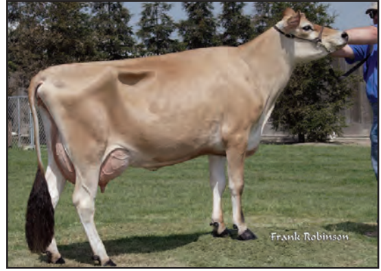
D&E PARAMOUNT VIOLET, E-90% GREAT-GRANDAM OF LOT 5