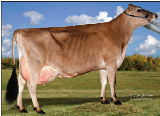
CINNAMON RIDGE DIMENSION BLESSED-ET, VG-84% SISTER TO THE GRANDAM OF LOT 71