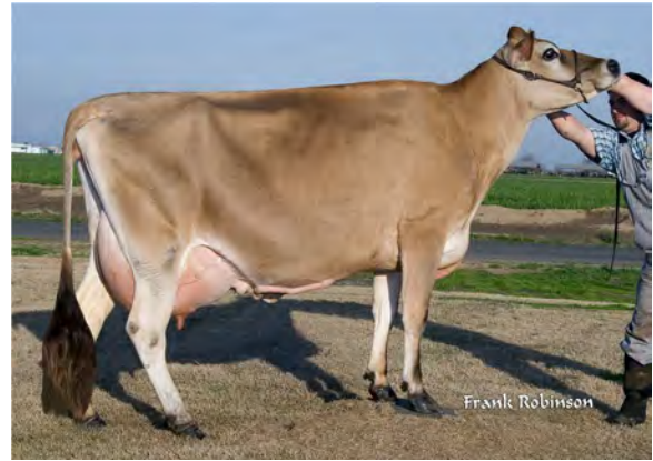
D&E ABE VIOLET, E-90% FIFTH DAM OF LOT 1