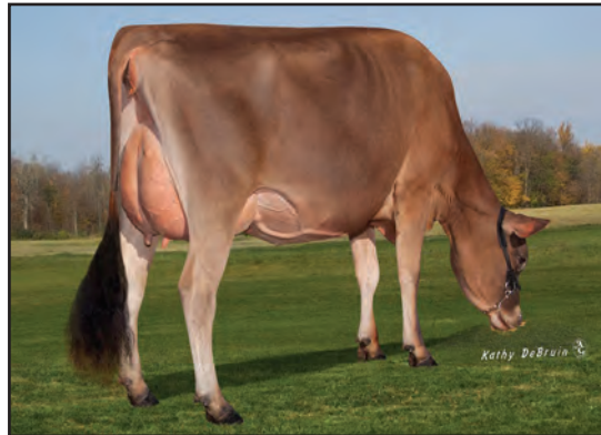
KILGUS VALENTINO MARIAH, E-92% SISTER TO THE GRANDAM OF LOT 34