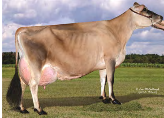
CINNAMON RIDGE JARRETT LADYBUG, E-90% FOURTH DAM OF LOT 109B