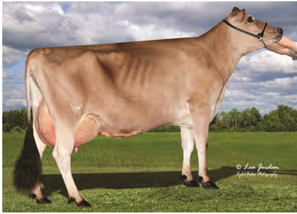
JX CINNAMON RIDGE CARCETTI BLAKE (4), D-79% DAM OF LOT 73