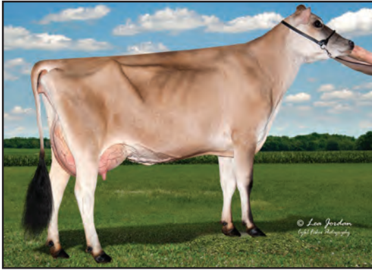
CINNAMON RIDGE AXIS APPRECIATE-ET, VG-87% SISTER TO THE DAM OF LOT 71