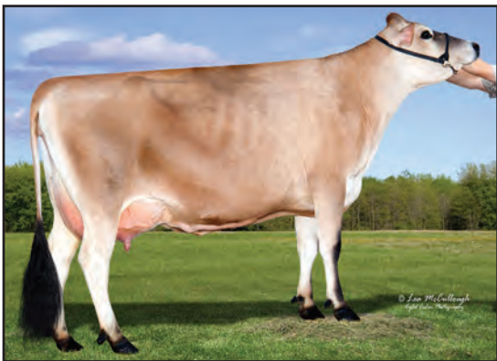
CINNAMON RIDGE VISIONARY CHASTITY-ET, VG-84% SISTER TO THE GRANDAM OF LOT 107E