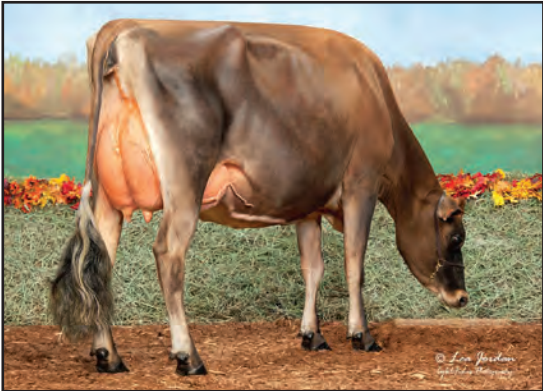
TLJ TEQUILA CARAMEL-ET, E-91% SISTER TO THE DAM OF LOT 3