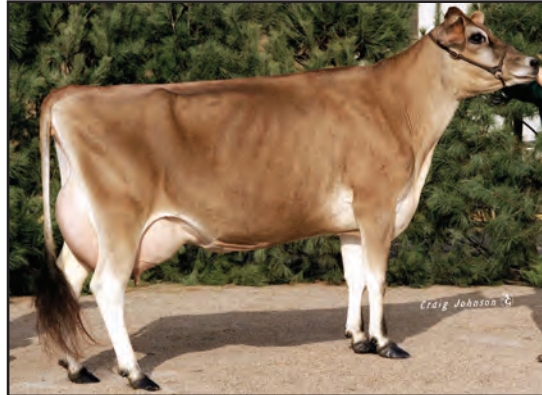
CANTENDO SOONER X RUBY, E-91% FIFTH DAM OF LOT 61 & 62