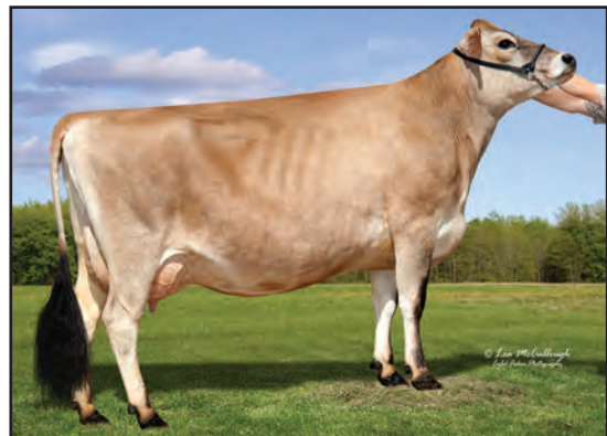
CINNAMON RIDGE MERCHANT BLISS-ET, VG-80% SISTER TO THE GRANDAM OF LOT 107E