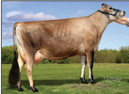
CINNAMON RIDGE PREMIER PEACE-ET, E-91% SISTER TO THE GRANDAM OF LOT 71