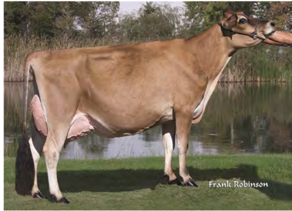
YOSEMITE KLASSIC TIDY E16494 {6}, E-92% GREAT-GRANDAM OF LOT 6