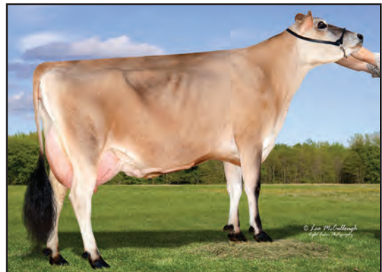
CINNAMON RIDGE VISIONARY CHARITY-ET, VG-88% SISTER TO THE GRANDAM OF LOT 71