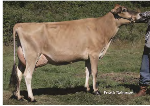
WF BARBER LEELA, E-92% GREAT-GRANDAM OF LOT 31