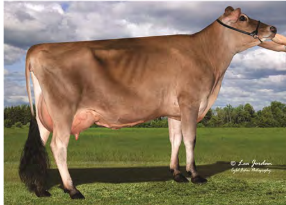
JX CINNAMON RIDGE SNAPDRAGON KATHY (5), VG-81% DAM OF LOT 108A