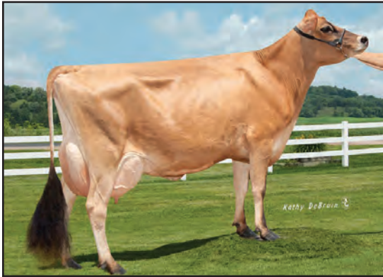
ALL LYNNS LOUIE VENETIA-ET, VG-83% SISTER TO THE GRANDAM OF LOT 5