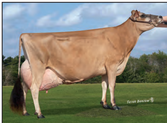
LYON IATOLA CONLEE, E-93% FROM THE SAME FAMILY AS LOT 28