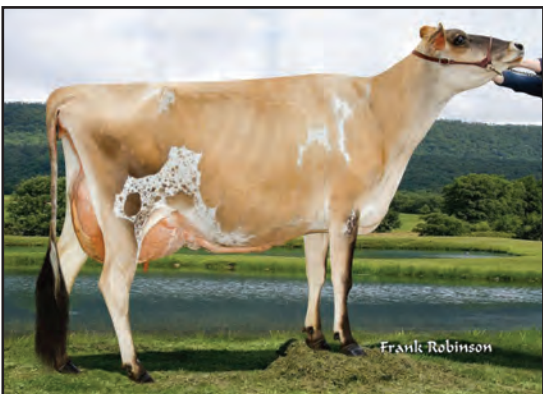
FAMILY HILL VINDICATON CARNIVAL, E-94% SISTER TO THE GRANDAM OF LOT 3