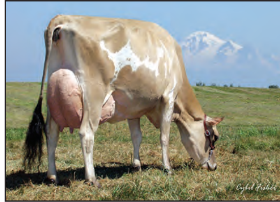
PLEASANT NOOK F PRIZE CIRCUS, E-97% GREAT-GRANDAM OF LOT 3