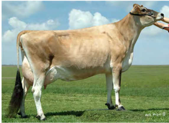
FLAMBEAU MANOR F CANDANCE, E-93% SAME FAMILY AS LOT 14