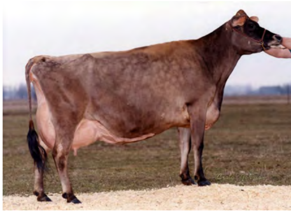
BOLLE-ACRES MJ WILLIE MAY, E-95% 2-TIME NATIONAL GRAND CHAMPION SIXTH DAM OF LOT 2