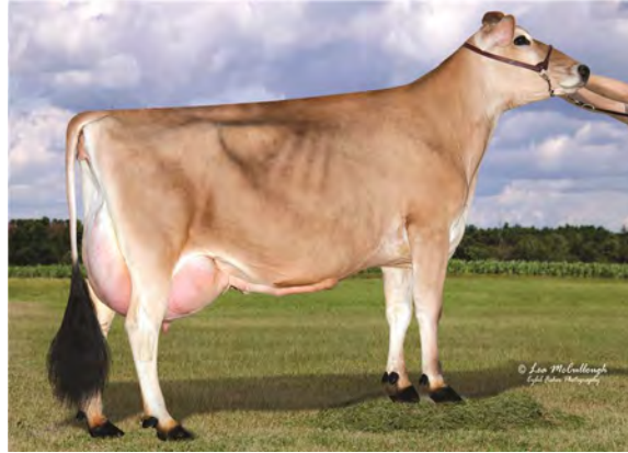
HIGH LAWN PRESCOTT COUNTESS-ET, VG-88% GRANDAM OF LOT 108E