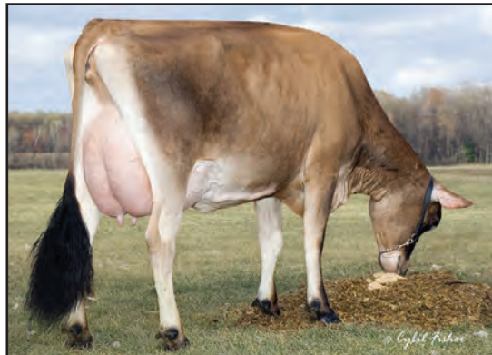
LYON IATOLA CIRRUS, E-90% GRANDAM OF LOT 28