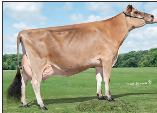
DEMENTS SAGE ROSEMARY, E-93% FROM THE SAME FAMILY AS LOT 61 & 62