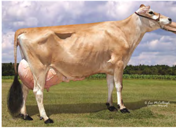
CINNAMON RIDGE RILEY CRICKET, E-92% GRANDAM OF LOT 75