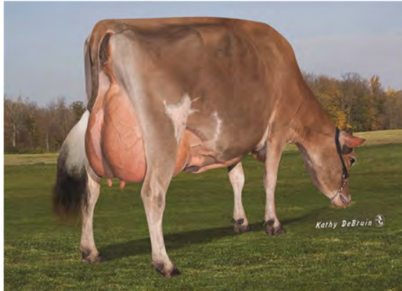
KILGUS RANDOM CORTNEY, E-93% GRANDAM OF LOT 29