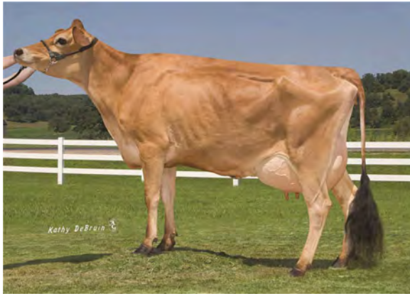
ALL LYNNS MAXIMUM VALERIE-ET, VG-80% GREAT-GRANDAM OF LOT 4