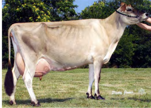
3M IMPERIAL GEM, E-95% FIFTH DAM OF LOT 110G