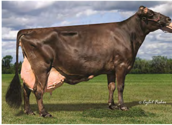
JACE CHAR STACI-ET, E-92% GREAT-GRANDAM OF LOT 72