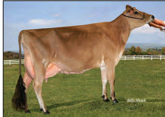
FAMILY HILL CONNECTON CHILLI-ET, E-91% SISTER TO THE GRANDAM OF LOT 3