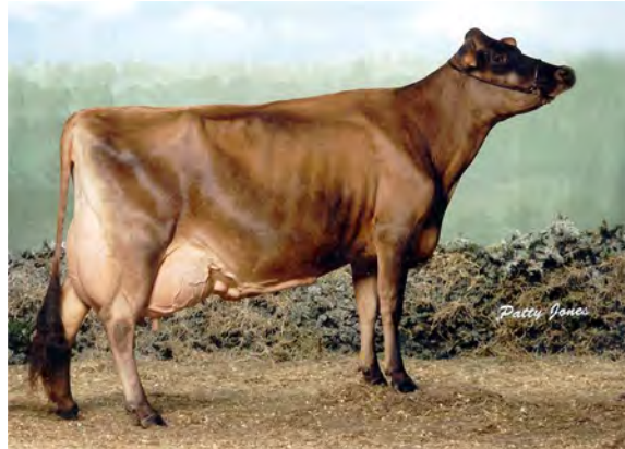
DUNCAN BELLE, EXCELLENT (CAN) FROM THE SAME FAMILY AS LOT 111A