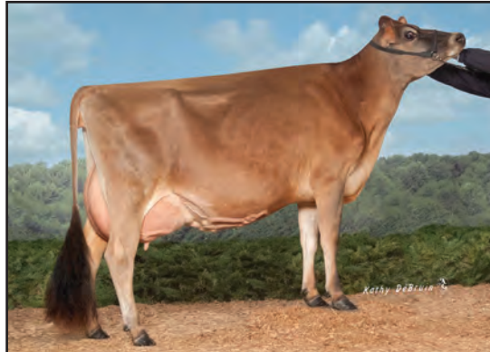
DEMENTS COUNTRY MILES ROXANNE, E-92% FROM THE SAME FAMILY AS LOT 61 & 62