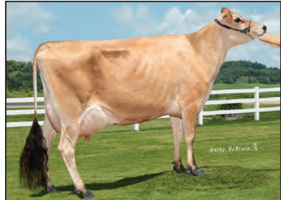
ALL LYNNS IMPULS VALENTINE-ET, VG-86% SISTER TO THE GRANDAM OF LOT 5