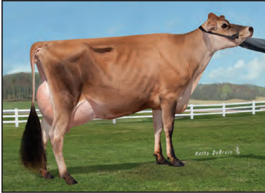
ALL LYNNS JUPITER VENUS-ET, VG-83% GRANDAM OF LOT 5