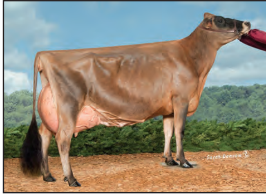
KILGUS GOVERNOR MAID {4}, E-94% GREAT-GRANDAM OF LOT 34