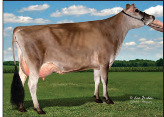
CINNAMON RIDGE AXIS GLORIA-ET, VG-83% SISTER TO THE DAM OF LOT 71