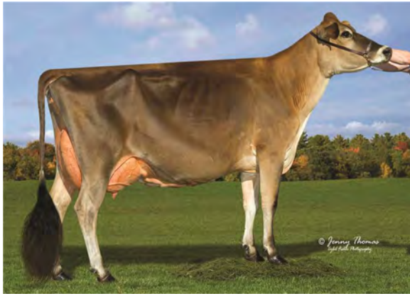
TIERNEYS INCENTIVE LUAU, E-92% SISTER TO THE GRANDAM OF LO 36