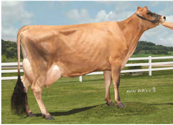
ALL LYNN'S JEVON VARINA-ET, VG-84% GREAT-GRANDAM OF LOT 8