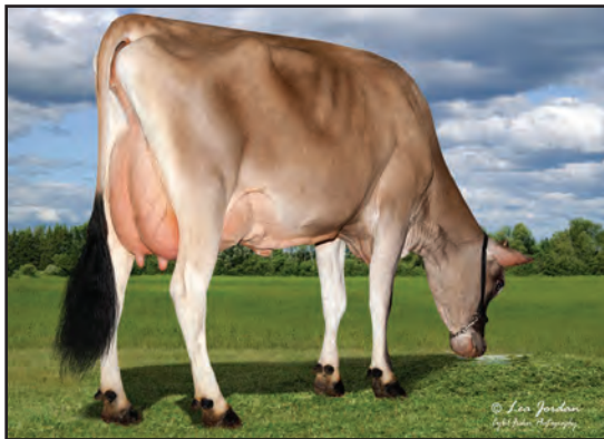
CINNAMON RIDGE AXIS CHOCOLATE-ET, VG-83% SISTER TO THE GRANDAM OF LOT 109C