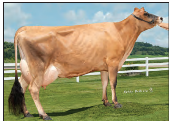
ALL LYNNS JEVEN VARINA-ET, VG-84% SISTER TO THE GRANDAM OF LOT 5