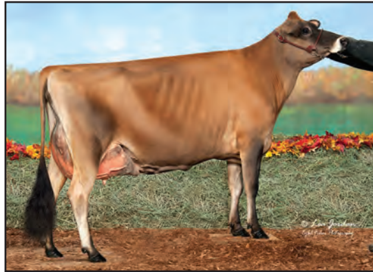
TOWNSIDE REPOSE REGINA, E-94% DAM OF LOT 35