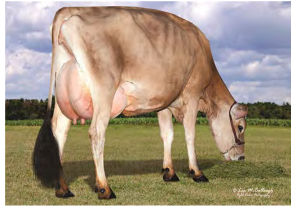
CINNAMON RIDGE MACHETE BLAIR, VG-80% SISTER TO THE DAM OF LOT 73