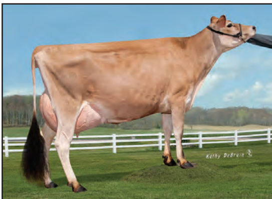
ALL LYNNS DIMENSION VENETTA-ET, VG-83% SISTER TO THE GRANDAM OF LOT 5