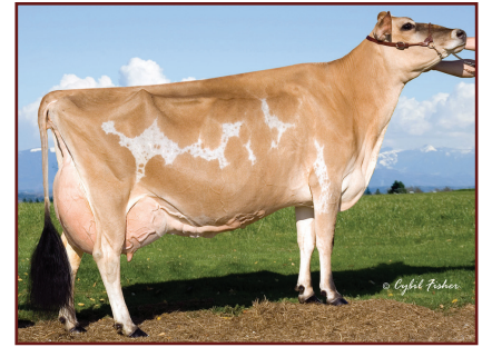
The Jersey breed focuses on strong cow families that combine functional type and outstanding production. The cows on this page all descend from 2003 and 2006 National Grand Champion Pleasant Nook F Prize Circus, Excellent-97% (above), and each have made an impact on the breed.

Other AGIL studies show that across the lifespan, Jerseys have the shortest average