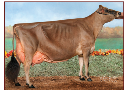
"Colton" has sired daughters who perform well both in the show ring and milking string. One such example is Hirds Colton Dream, Excellent-96% (below), the 2018 National Grand Champion and 2017 Premier Performance Cow at the All American Jersey Show in Louisville, Ky.