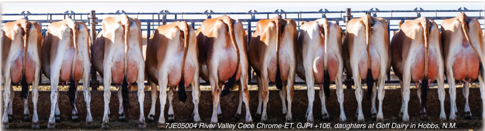
7JE05004 River Valley Cece Chrome-ET, GJPI +106, daughters at Goff Dairy in Hobbs, N.M.

In 2020, the American Jersey Cattle Association recorded 121,724 animals, the fifth most in its history. 87% of registration applications were submitted and processed electronically, and 72% of the calves registered were permanently identified by double-matched tamper-evident ear tags. Production for the breed reached new heights and the breed continued to see growth in numbers in the dairy industry.