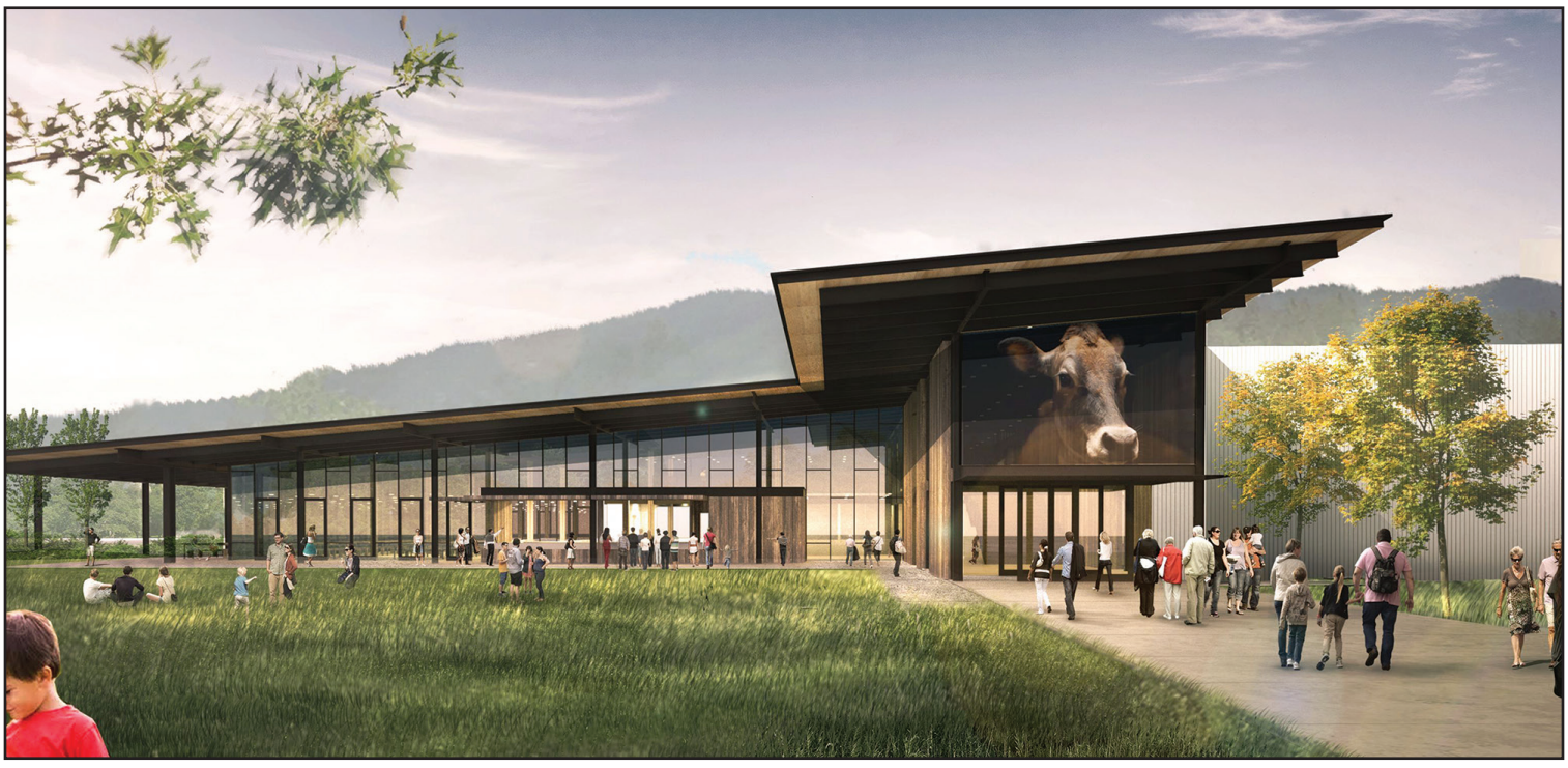
ARCHITECTURAL RENDERING OF THE VISITOR CENTER UNDER CONSTRUCTION AT TILLAMOOK CHEESE

SHERATON PORTLAND AIRPORT HOTEL 8235 NE Airport Way, Portland, OR 97220 Tel: +1 503 251-2800