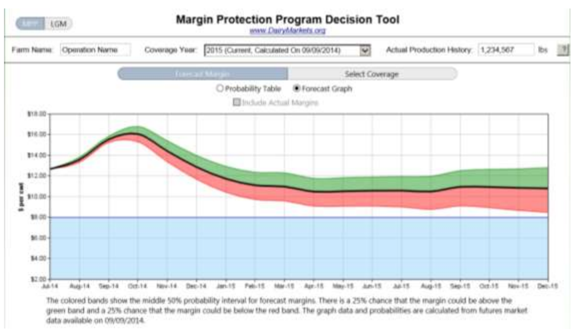
Farm Service Agency tool http://www.fsa.usda.gov/FSA/pages/content/farmBill/fb_MPPDTool.jsp

produced an analysis tool using a different approach. Their Margin Protection Program Calculator (shown on the next page) allows users to enter their own estimates for future milk prices and feed costs. Based on those prices, the calculator determines the expected ration cost and IOFC margin. Then, by entering production levels and electing a coverage percentage, the analysis will show the insurance costs and expected indemnity returns for each coverage level option.