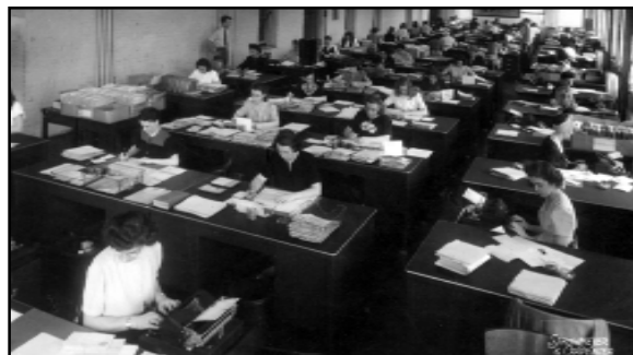
More than 60 secretaries are pictured in the registration and transfer section of the AJCC’s offices in the late 1940s.